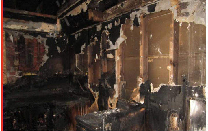
PHOTO OF KITCHEN IN GALBRAITH RESIDENCE AFTER FIRE LOSS

Greater Dayton Construction Group has finalized restoration efforts at the Galbraith Residence in Beavercreek. The +/- 2,000 sqft. home suffered extensive damage after a fire ignited in the kitchen and spread quickly throughout the structure.