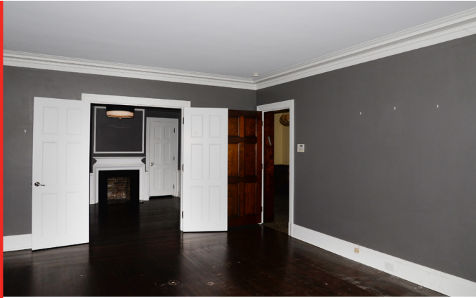
BEFORE PHOTO OF MASTER BEDROOM AT SCHEAR RESIDENCE

After the successful completion of a third-floor remodel last Spring, the Schears of Oakwood have reengaged Greater Dayton Building & Remodeling to complete their master-suite renovation.