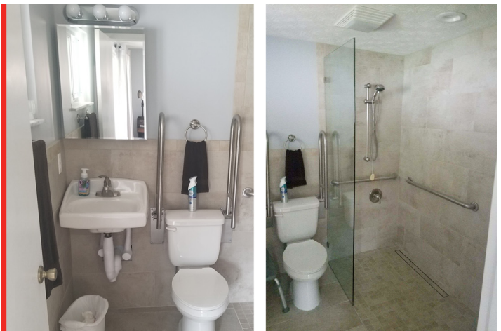
AFTER PHOTOS OF REMODELED BATHROOM AT SIMANSKI RESIDENCE

Updates in the bathroom included new plumbing and light fixtures, ceramic tile and grab bars.