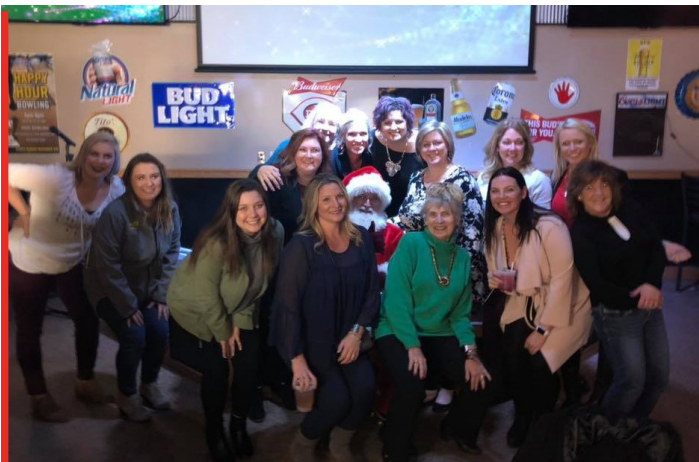
BLUE GOOSE PARTY ATTENDEES POSE FOR A QUICK GROUP PHOTO DURING THE EVENT

The event — sponsored by GDCG and fellow trade-partners, FEC, Flooring America, Glass America, Buckeye Insurance Group, and Long Cleaners — featured drinks, good food, a visit from Santa, an interactive DJ, and raffle items.