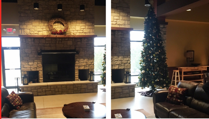
PHOTOS OF EXISTING LOBBY AREA AT VINEYARD CHURCH

Oberer Thompson Company recently wrapped-up building renovations at Dayton Vineyard Church, located at 4051 Indian Ripple Rd. in Beavercreek.