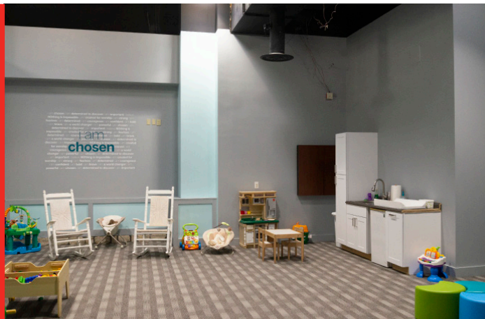
AFTER PHOTO OF RENOVATED CLASSROOMS AT VINEYARD CHURCH

The +/- 2,500 sqft. project scope included the demolition of existing stone columns, and the conversion of an existing lobby into four classrooms and a “mother’s” room. Improvements also included new paint, flooring, and lighting fixtures.