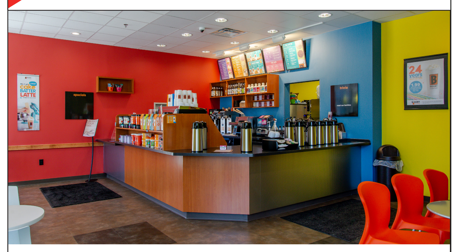
AFTER PHOTOS OF POINT OF SALES / ORDER PICKUP AREA (TOP) AND RESTAURANT STOREFRONT (BELOW) AT BIGGBY COFFEE IN DAYTON, OHIO

Oberer Thompson Company recently completed the build-out of the Dayton-Area's first Biggby Coffee franchise.