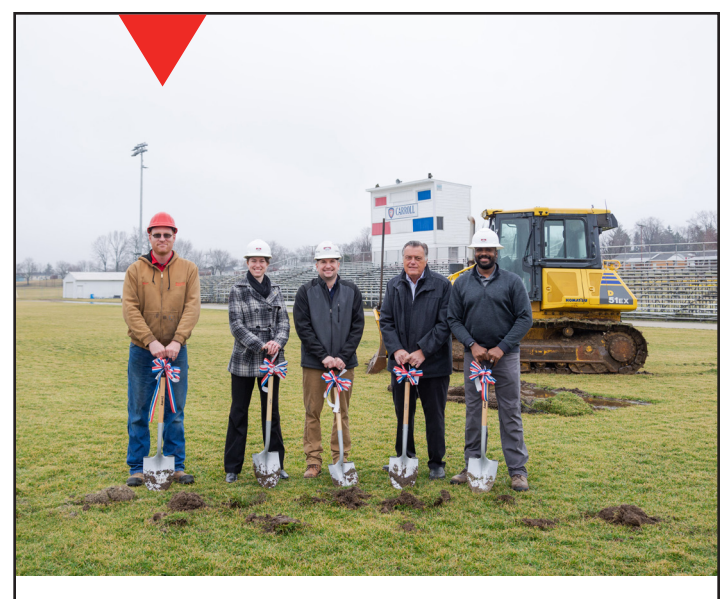
OTC EMPLOYEES POSE FOR A PHOTO DURING THE GROUNDBREAKING CEREMONY