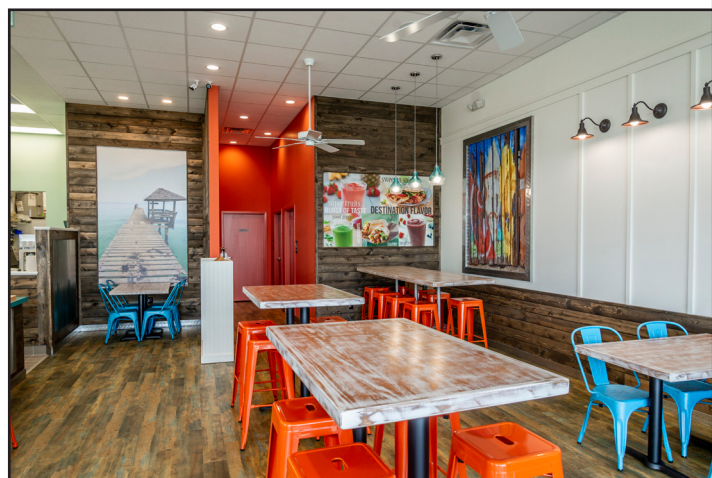
AFTER PHOTO OF DINING ROOM AT TROPICAL SMOOTHIE CAFÉ IN MASON, OHIO