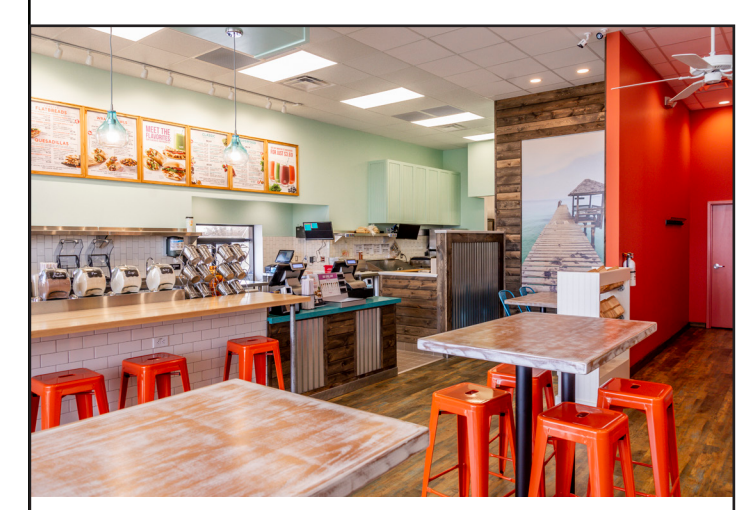
AFTER PHOTO OF POINT OF SALES AREA AT TROPICAL SMOOTHIE CAFÉ IN MASON, OHIO

This project is GDCG's latest in an ongoing relationship with the Tropical Smoothie franchise, having previously completed renovations/tenant improvements at seven other locations.