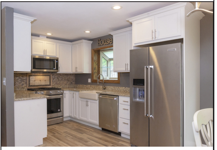
AFTER PHOTO OF KITCHEN AT HOUSE RESIDENCE (REGIONAL RESIDENTIAL KITCHEN UNDER $30K WINNER)