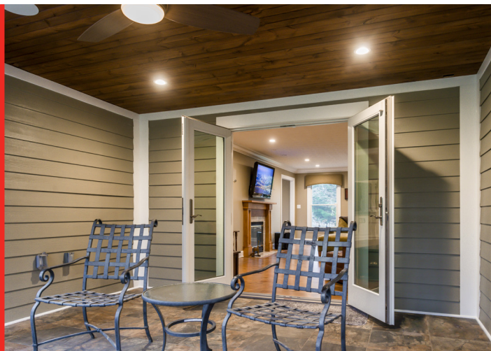
AFTER PHOTO OF SUNROOM ADDITION AT THE LANE RESIDENCE

To meet the remodeling needs on the homeowner's wish list, GDB&R Sales Representative — Matt Jones — designed an open concept floor plan that included the reconfiguration of the current kitchen and dining room, and the addition of a sunroom. The upgraded kitchen now features an eat-in island, new cabinetry, appliances, and pre-engineered wood flooring.