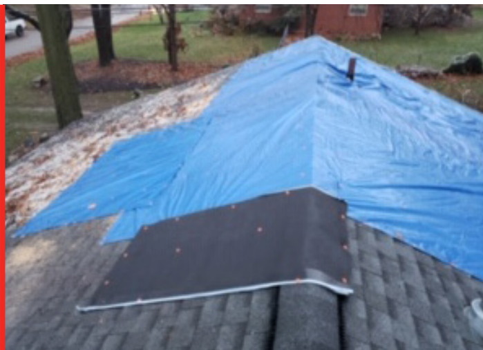
TEMPORARY REPAIRS AT THE BAHUN RESIDENCE

In the days following the storm, Greater Dayton Construction Group's Emergency Response Team responded to over 100 leads and worked overtime to provide homeowners with temporary repairs and initial plans for further restoration.