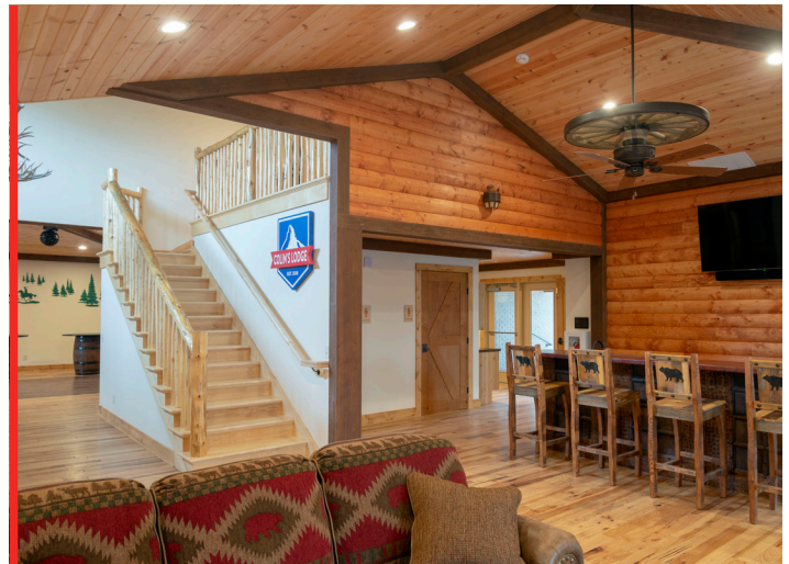
AFTER PHOTO OF LOUNGE AREA AT COLIN'S LODGE

This is the latest project OTC has performed with The Connor Group, having previously completed numerous renovations to its apartment communities in Ohio and beyond, and most recently the construction of its +/-17,200 sqft. airplane hangar in Miamisburg.