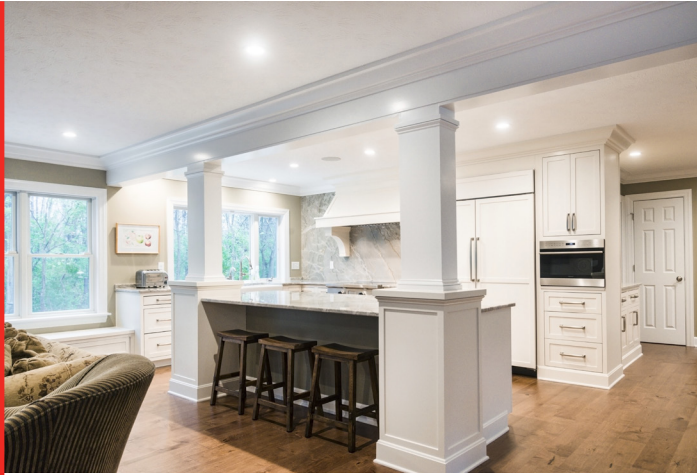
AFTER PHOTO OF KITCHEN RENOVATION AT LANE RESIDENCE

Greater Dayton Building & Remodeling has substantially completed work on a first-floor addition and renovation at the Lane Residence in Springboro, Ohio.