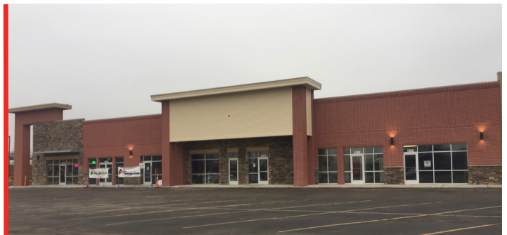
PROGRESS PHOTO OF YANKEE STATION DURING EXTERIOR IMPROVEMENT EFFORTS

The exterior of the shopping center now features an EIFS and brick facade, cultured stone, and new store-fronts.