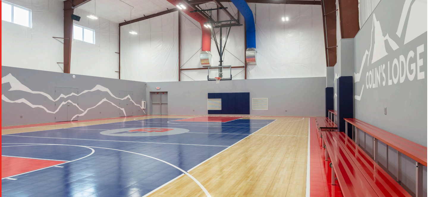
AFTER PHOTO OF THE NEW ADDITION / GYM AREA AT COLIN'S LODGE