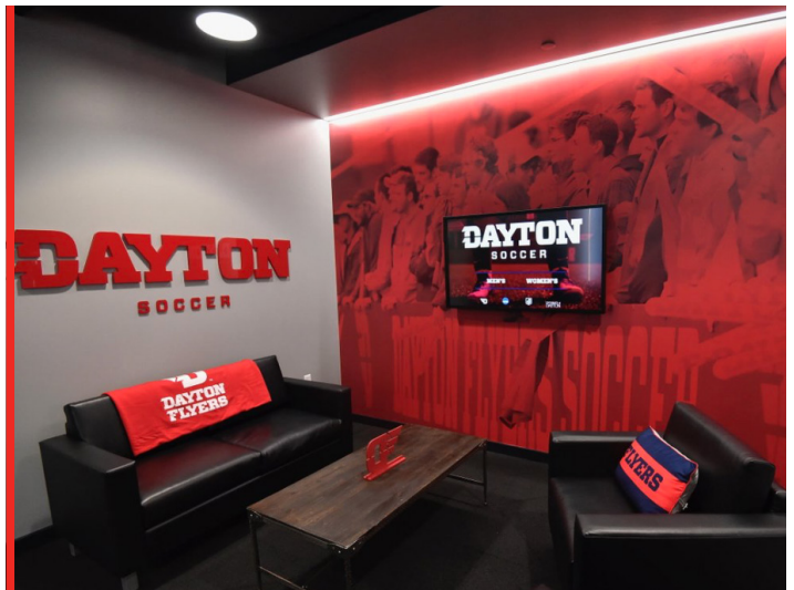
AFTER PHOTO OF HIDALGO TEAM LOUNGE

*Information gleaned from UD Athletics' press release.