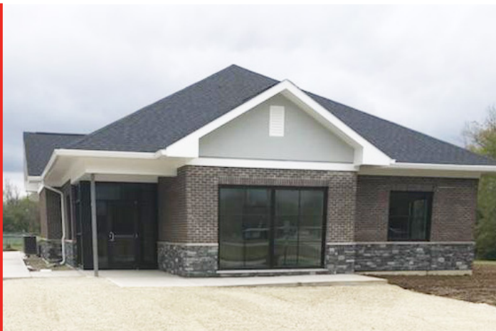
PROGRESS PHOTO OF CALVIN ELECTRIC'S NEW OFFICE BUILDING

GDC, Ltd. collaborated with architect James Hawthorn to develop a new +/-3,300 sqft. office building that features seven office spaces, a reception area, two conference rooms, a break room and an accessible kitchen.