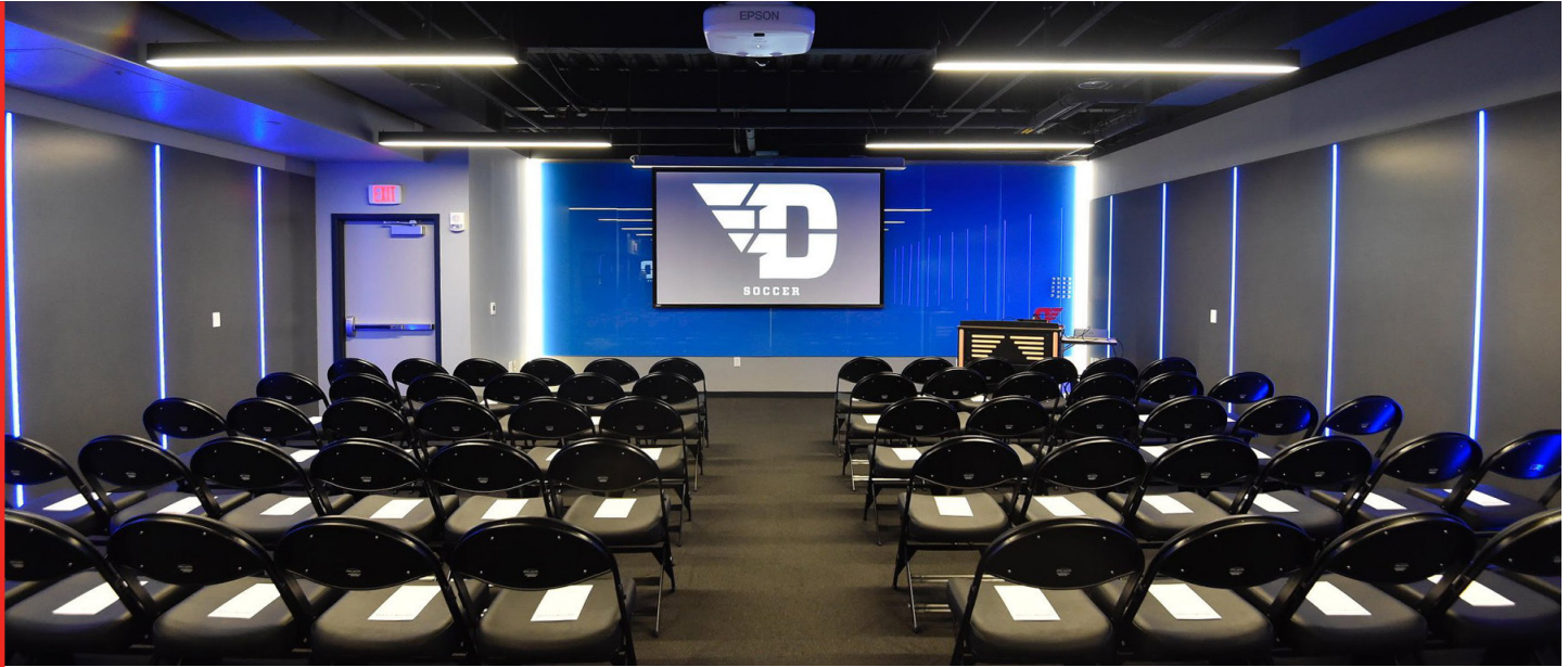
AFTER PHOTO OF TEAM MEETING SPACE / FILM AREA AT HIDALGO LOUNGE