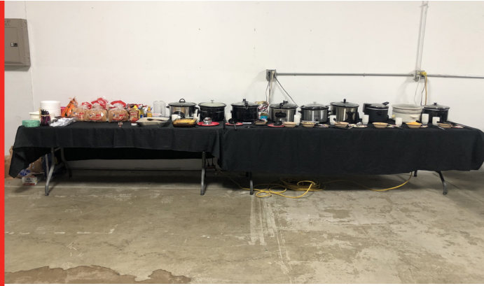
DELICIOUS CHILI ENTRIES PRIOR TO JUDGING

On Friday, October 26th, Greater Dayton Construction Group and Oberer Thompson Company held a chili cook-off competition for all employees.