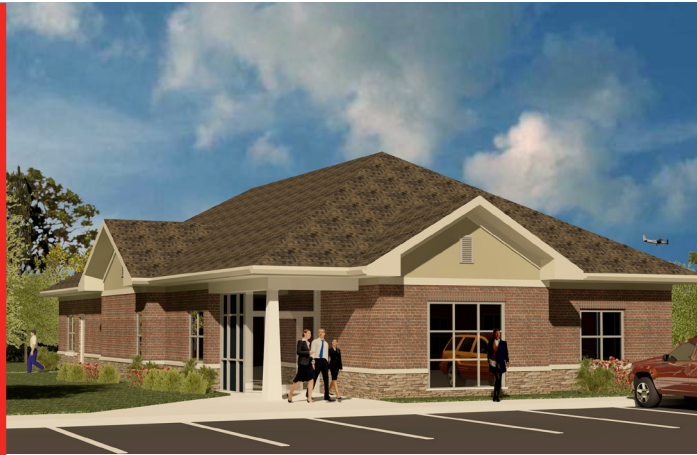
RENDERING OF CALVIN ELECTRIC OFFICE BUILDING -RENDERING COURTESY OF JAMES HAWTHORN

GDC, Ltd. has substantially completed a new office building project for trade partner Calvin Electric, located at 7272 Pleasant Plain Rd. in Clayton, Ohio.