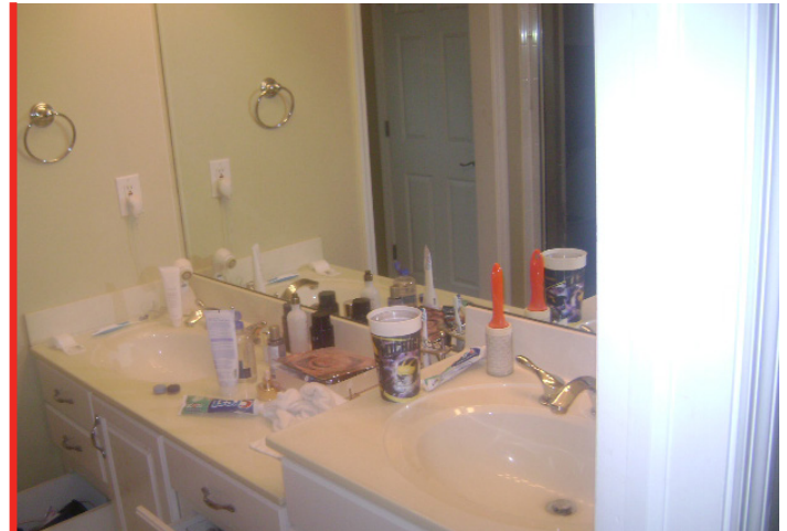
BEFORE PHOTO OF BRUGGEMAN BATHROOM

Greater Dayton Building & Remodeling recently wrapped up a master suite addition / renovation in Kettering, Ohio.