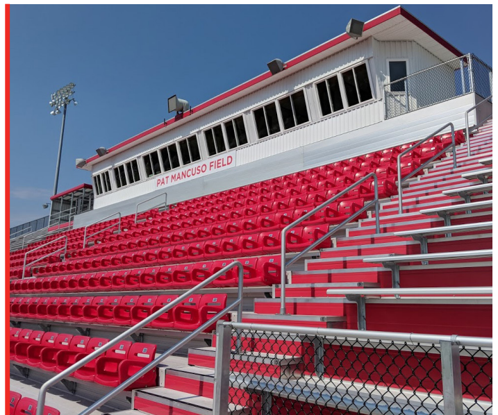
AFTER PHOTO OF +/- 600 SQFT. PRESS BOX WITH PLATFORM LIFT