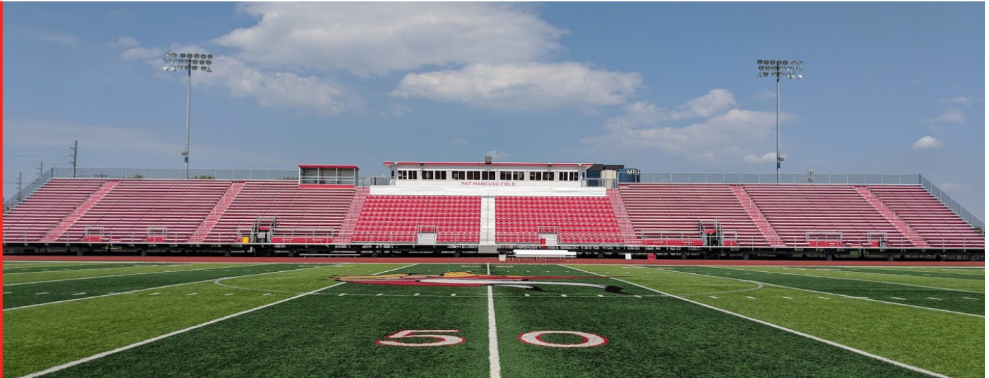
PHOTO OF MANCUSO FIELD AT VIKING STADIUM AFTER GRANDSTAND UPGRADES