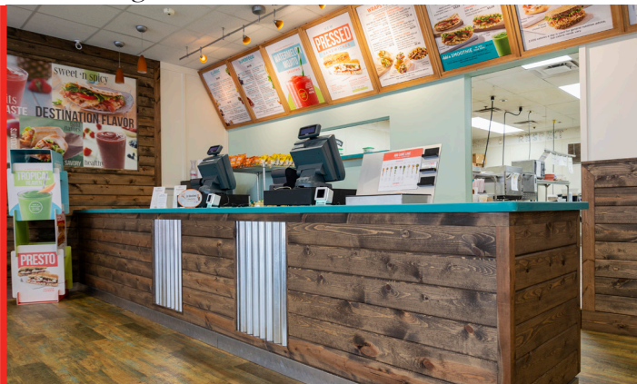
RENOVATED POINT OF SALES AREA AT TROPICAL SMOOTHIE

As part of a corporate reimagining initiative, the 2,200 sqft. space received interior upgrades to modernize the restaurant. The existing “island themed” bamboo and berry-colored walls were removed and replaced by board & batten millwork and PVC beadboard wainscoting.