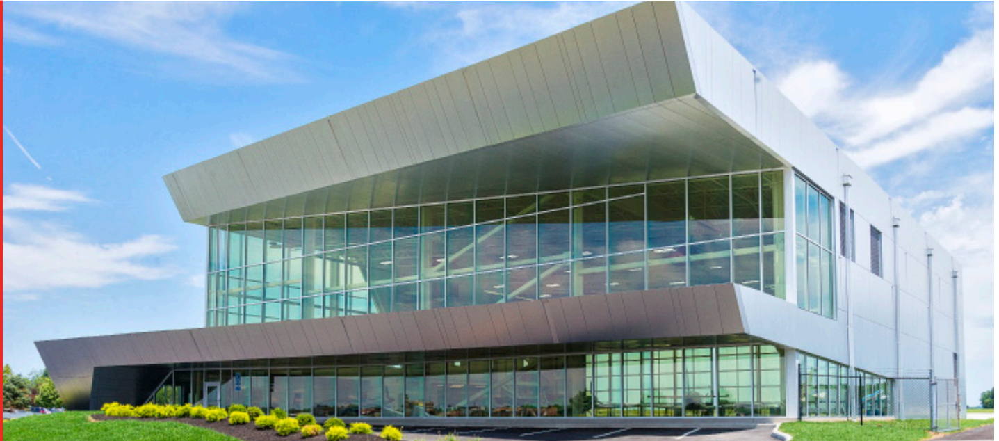
FRONT ELEVATION OF THE CONNOR GROUP'S NEW HANGAR BUILDING