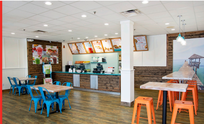
AFTER PHOTO OF DINING AREA AT TROPICAL SMOOTHIE CAFÉ IN CENTERVILLE

Earlier this month, GDC, Ltd. finalized renovations at Tropical Smoothie Café (OH-004), located at Washington Square Plaza in Centerville, Ohio.