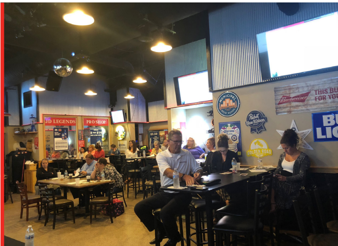
INDUSTRY PROFESSIONALS ATTEND A CE COURSE AT J.D. LEGENDS

Courses were hosted at J.D. Legends in Franklin, Ohio, and focused on bonding insureds and maintaining proper ethical protocol.