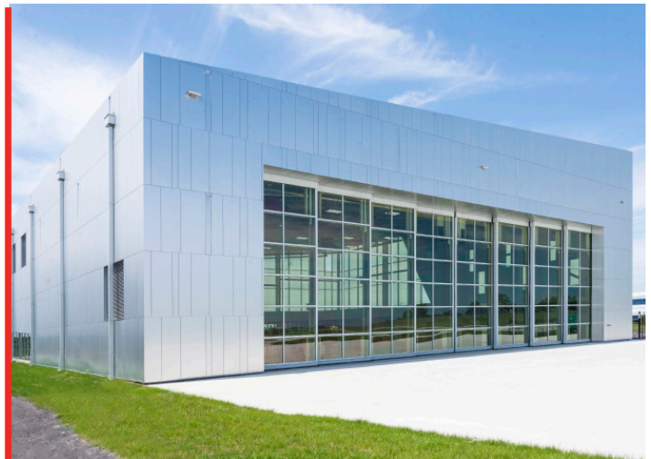
REAR ELEVATION OF THE CONNOR GROUP'S HANGAR

This is the latest project OTC has performed for The Connor Group, having previously completed improvements and renovations to numerous apartment communities in Ohio and beyond.