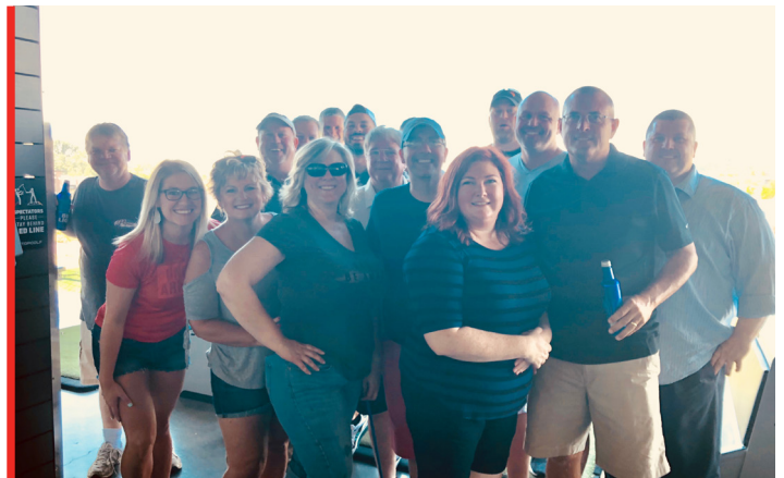
GDC, LTD. MEMBERS POSE FOR A QUICK PHOTO DURING THE NIGHT OUT

To show appreciation for a successful first half of the year, members of GDC, Ltd. attended a “team-building” outing at Top Golf in West Chester, Ohio.