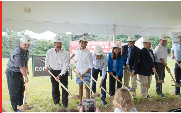
PROJECT TEAM MEMBERS, AND NORTH SPRING DENTAL REPRESENTATIVES, POSE FOR A PHOTO DURING THE GROUND BREAKING CEREMONY

North Spring Dental team members, along with Oberer Thompson Company and Springfield city officials, held a groundbreaking ceremony on Friday, July 21 st , to mark the beginning of construction on its new dentist office.