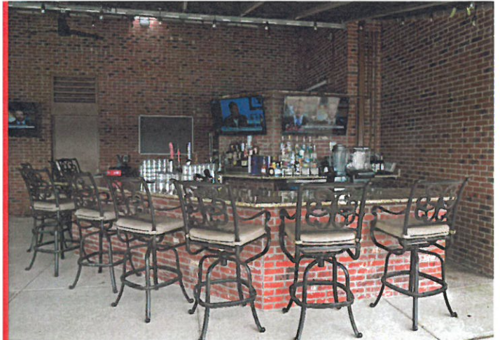
NEW OUTDOOR BAR AT NCR COUNTRY CLUB

Earlier this Spring, Oberer Thompson Company completed an outdoor bar project at NCR Country Club in Kettering, Ohio.