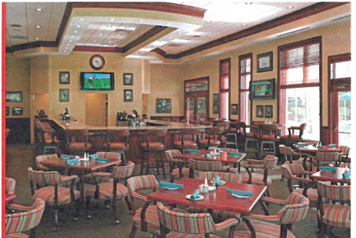
NCR GRILLE ROOM — COMPLETED BY OTC IN 2006

This project is OTC's latest in an on-going relationship with NCR Country Club, having previously completed renovations to the club's Grille Room in 2006.