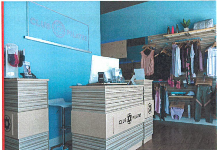
FRONT DESK / SALES AREA AT CLUB PILATES IN BEAVERCREEK

Oberer Thompson Company recently completed a tenant improvement project for Club Pilates in Beavercreek, Ohio.