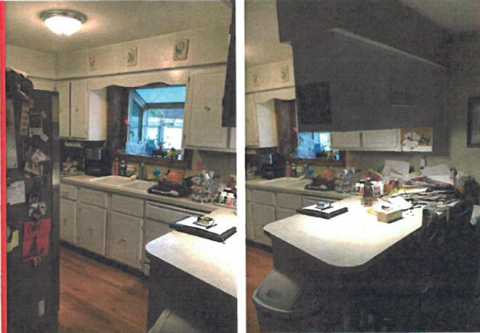
BEFORE PHOTOS OF KITCHEN AT HOUSE RESIDENCE

Greater Dayton Construction Group's Home Services Division recently completed a kitchen renovation at the House Residence in Centerville, Ohio.