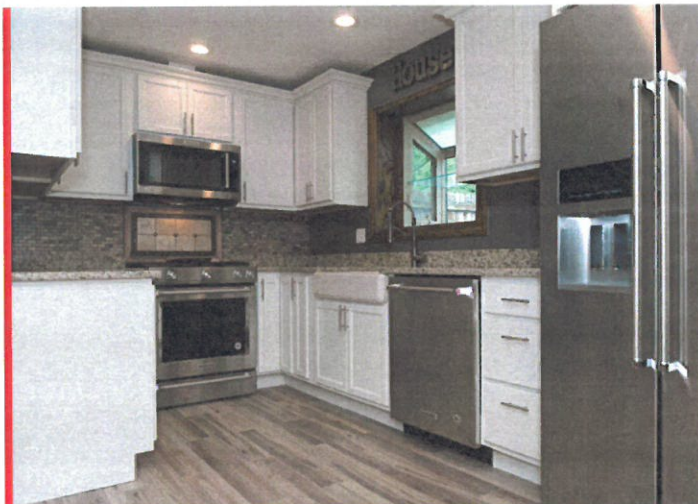
AFTER PHOTO OF KITCHEN AT HOUSE RESIDENCE - PHOTO COURTESY OF CAROLINE MORGAN

To meet the needs on the homeowner's wishlist, the project team worked to develop a reconfigured kitchen layout — without sacrificing space from surrounding areas.