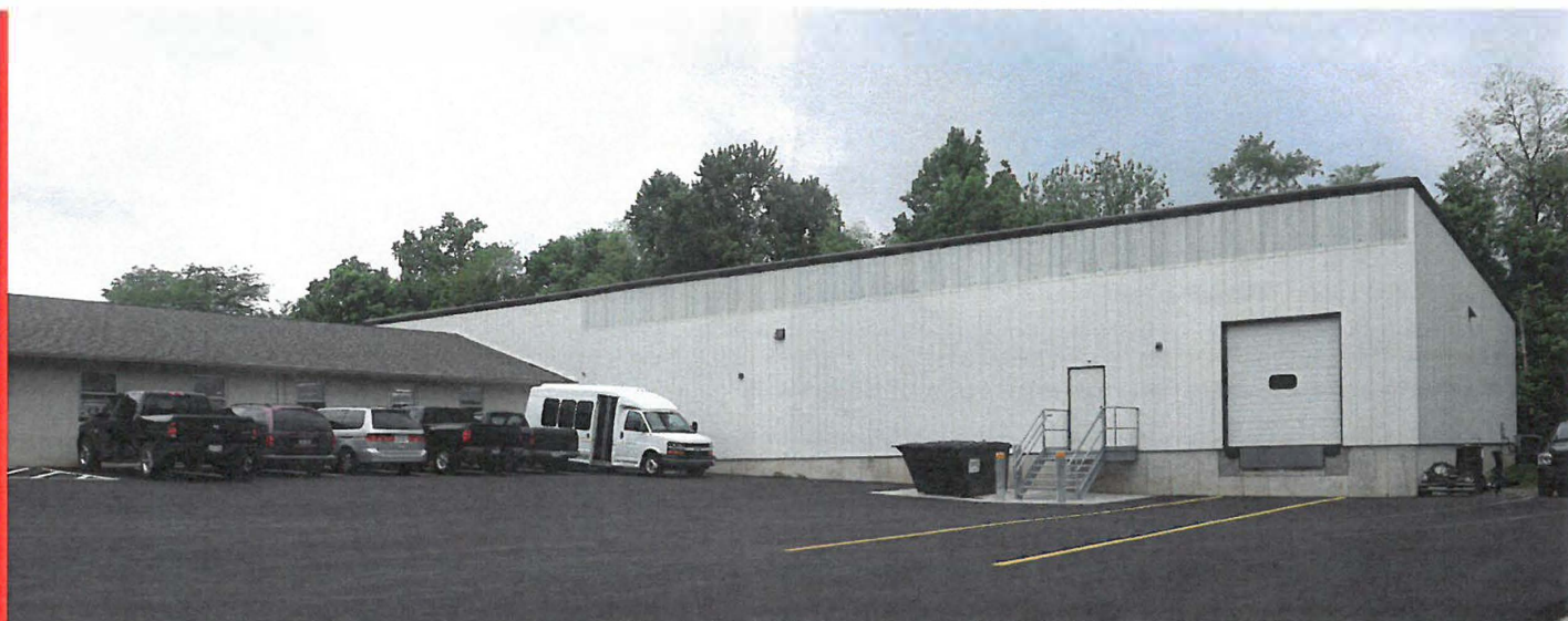
REAR ELEVATION OF BUILDING ADDITION AT FELLOWSHIP TRACT LEAGUE