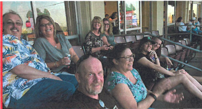
ATTENDEES POSE FOR A QUICK PHOTO DURING THE BALLGAME