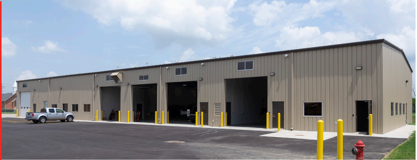
FRONT ELEVATION OF NEW MAINTENANCE BUILDING AT HUBER HEIGHTS CITY SCHOOLS' TRANSPORTATION CENTER