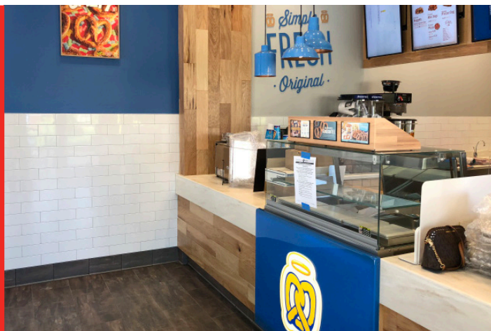
PROGRESS PHOTO OF POINT OF SALES AREA AT AUNTIE ANNE'S

Located in the former Teavana location, the updated +/- 1,000 sqft. restaurant features new tile flooring, a wood-plank feature wall, a point of sales area, an indoor dining space (up to 6 occupants), and an outdoor patio (with seating for 16.)