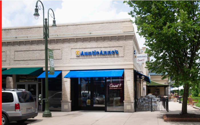
FRONT ELEVATION OF AUNTIE ANNE'S AT THE GREENE

Oberer Thompson Company has substantially completed its latest tenant improvement project at the Greene Town Center in Beavercreek, Ohio for Auntie Anne's.