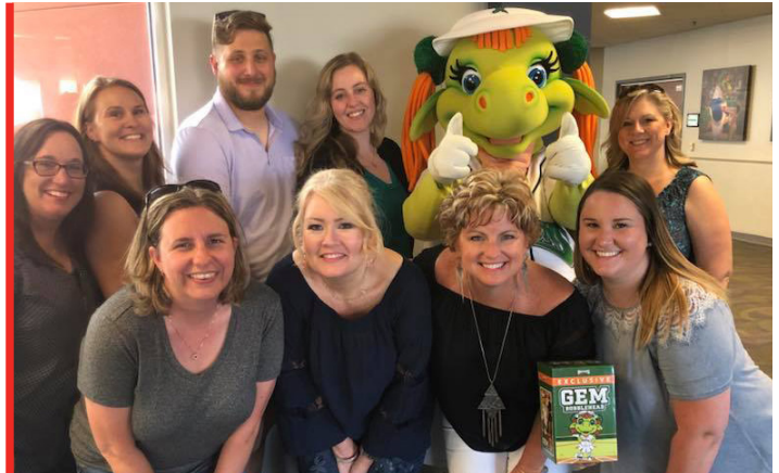
GAME ATTENDEES POSE FOR A QUICK PHOTO DURING THE DRAGON'S GAME

On Tuesday, June 11th, Greater Dayton Construction Group hosted an evening out at the ballpark for professionals in the home insurance industry.