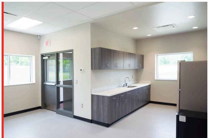
KITCHENETTE IN EMPLOYEE LOUNGE AT HUBER HEIGHTS CITY SCHOOLS' TRANSPORTATION CENTER