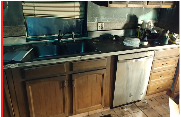
WALTERS RESIDENCE KITCHEN AFTER FIRE LOSS

Upon inspection of the home, firefighters determined the fire began when the family cat knocked over a candle causing flames to quickly consume the home. After GDCG's Restoration Team further evaluated the property, the structure was ruled a total loss, and will require full reconstruction efforts to meet current code regulations.