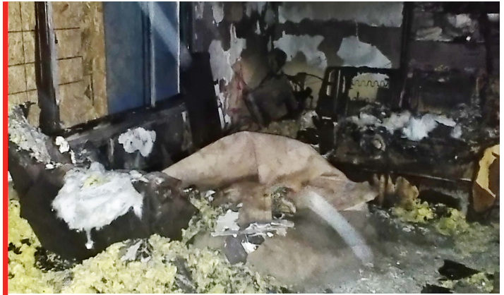
PHOTO OF INTERIOR DAMAGE AT WALTERS RESIDENCE

In April of 2018, Greater Dayton Construction Group's Emergency Response Team (ERT) responded to a house fire at the Walters Residence in Brookville, Ohio.