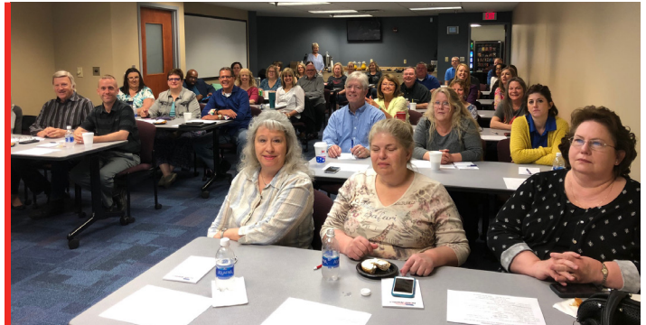
CE COURSE ATTENDEES POSE FOR A PHOTO BEFORE THE CLASS

The courses were hosted at 5/3rd Field (Dayton Dragon's Stadium) in Dayton, Ohio, and focused on Underwriting Teen & Senior Drivers and Role of Direct Repair in Claims.