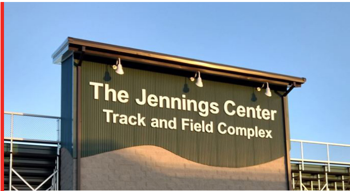
AFTER PHOTO OF THE JENNINGS CENTER TRACK AND FIELD COMPLEX

To celebrate the beginning of the Spring sports season (and the completion of its new track & field complex), Greenville City Schools hosted a dedication/ribbon cutting ceremony on Wednesday, April 11 th .