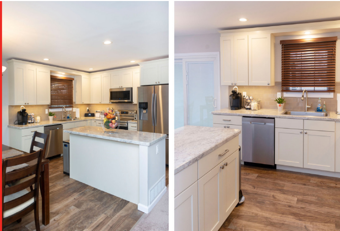
AFTER PHOTOS OF DILLER KITCHEN