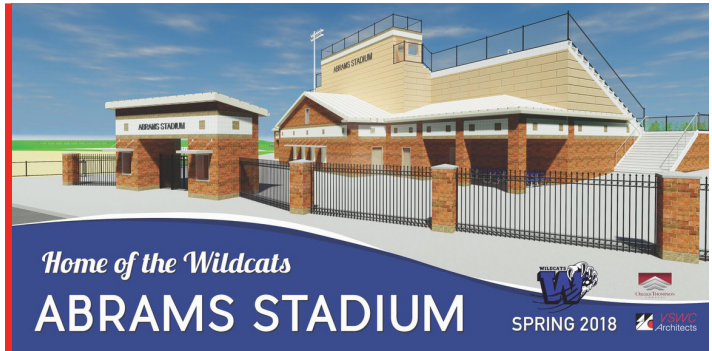
RENDERING OF ABRAMS STADIUM

To prepare for the upcoming sports season, Williamsburg High School contracted Oberer Thompson Company to provide renovations to its football stadium.