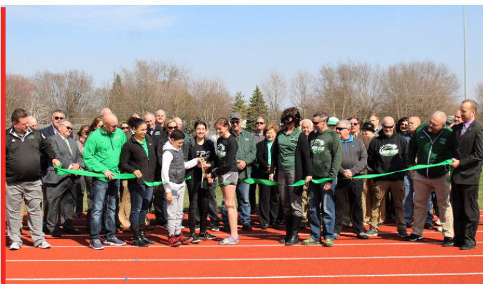
MEMBERS OF THE FRIENDS OF HARMON FIELD, AND GREENVILLE CITY SCHOOLS PARTICIPATE IN THE "RIBBON CUTTING" AT THE JENNINGS CENTER

In addition, the new track and field area now includes grandstands (1,000+ seats), Musco sports lighting, a new irrigation system, scoreboard, press box, and fencing.