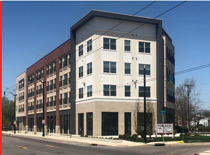
FRONT ELEVATION OF THE FLATS AT SOUTH PARK

On Friday, April 27 th , Oberer Thompson Company hosted an open-house reception at the Flats at South Park to celebrate the substantial completion of the 43-unit apartment complex in Dayton, Ohio.