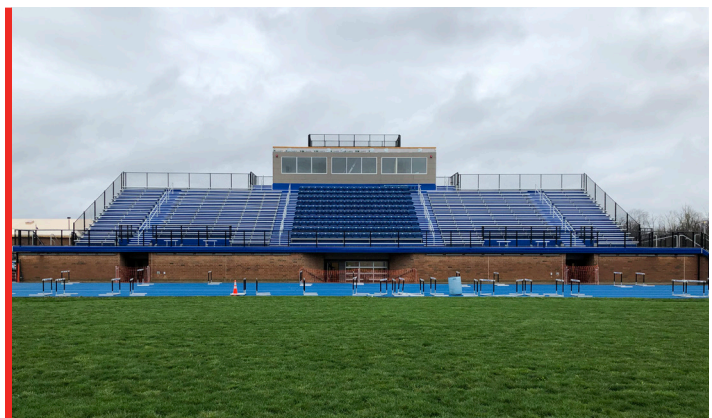
AFTER PHOTO OF ABRAMS STADIUM GRANDSTAND AND PRESS BOX

The new facility — known as "Abrams Stadium" — features a 950-seat grandstand, stadium press box, and multi-purpose facility.