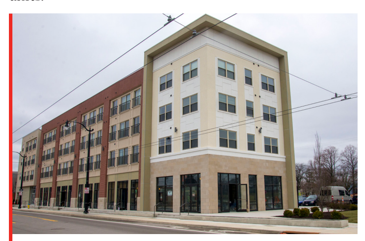
FRONT ELEVATION OF THE FLATS AT SOUTH PARK

Located along Warren Street at Burns Avenue, the four-story, mixed-use building includes 43 apartments on the upper floors, and +/-10,500 sqft. of commercial space for restaurants and service firms on the ground floor. The apartments on the upper levels are a mix of studios, one-bedroom, and two-bedroom units.