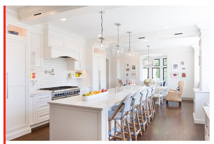
DAVIS RESIDENCE KITCHEN (RESIDENTIAL KITCHEN $100,001-$150,000)

The National Association of the Remodeling Industry (NARI) recently recognized Greater Dayton Building & Remodeling (again!) with three 2018 Regional Contractor of the Year (CotY) Awards.