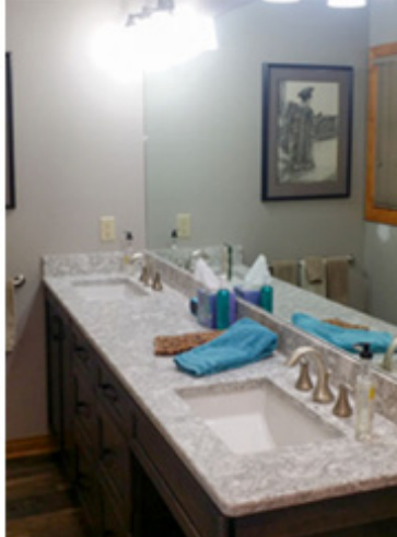
AFTER PHOTOS OF STRATMOEN MASTER BATH

The new master bath now features an accessible shower and bath area, Cambria Quartz countertops, Core-Tec LVT flooring, and Dura Supreme cabinetry.