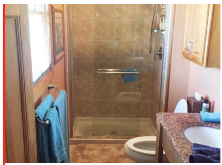
BEFORE PHOTO OF STRATMOEN MASTER BATH

In December of 2017, the Stratmoens of Centerville came to Greater Dayton Building & Remodeling with an extensive wish list for a master suite renovation.