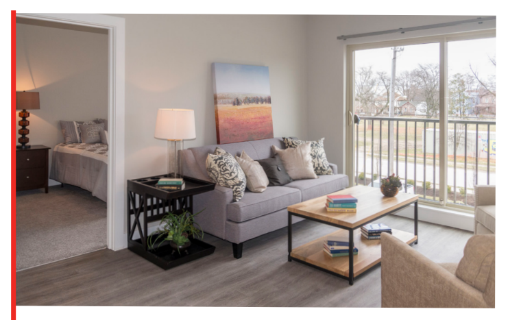
INTERIOR LIVING SPACE AT THE FLATS AT SOUTH PARK

The Flats at South Park are currently leasing with resident move-in scheduled for next month.