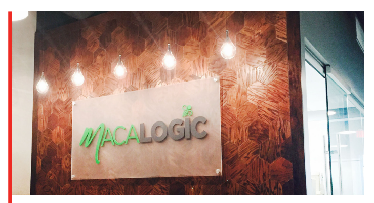
PHOTO OF OAK ACCENT WALL WITH HONEYCOMB DETAIL

The project's renovation scope included a \pm 4,160 sqft. build-out of additional office spaces, a conference room, and a kitchenette.