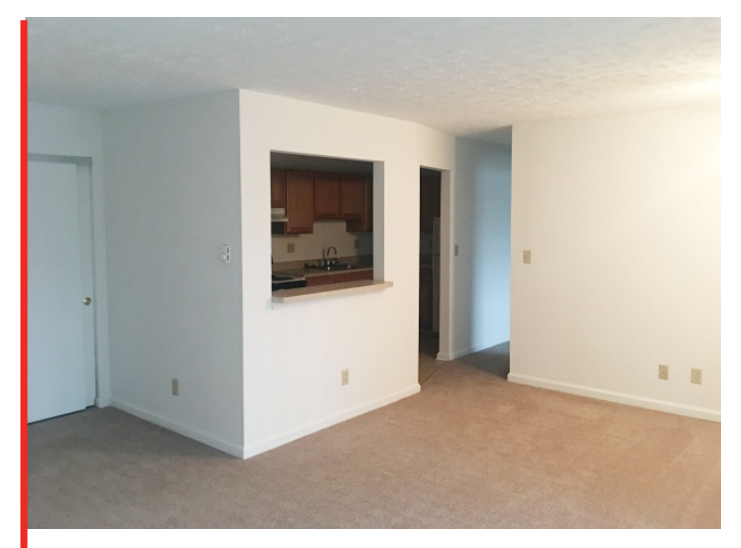
AFTER PHOTO OF RESTORED APARTMENT UNIT

After the initial investigation, GDCG Estimator Josh Eversole, reported that the complex had suffered extensive fire damage to half of its units — with three requiring full reconstruction.