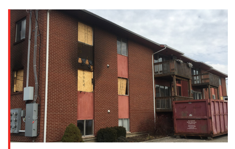
FRONT ELEVATION OF CENTERVILLE APARTMENT COMPLEX AFTER FIRE LOSS

In November 2017, GDCG's Insurance Restoration Team began reconstruction efforts on a 12-unit apartment complex in Centerville, Ohio.