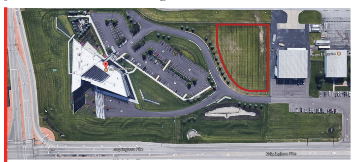
AERIAL PHOTO OF THE CONNOR GROUP HEAD-QUARTERS AND PROPOSED HANGAR LOCATION (OUTLINED IN RED)

The structure will also feature a 30'x100' biparting glass hangar door, ACM panel lighting, a High-X fire suppression foam system, a 12,000 gallon fuel dispenser tank, and two large air circulation fans.