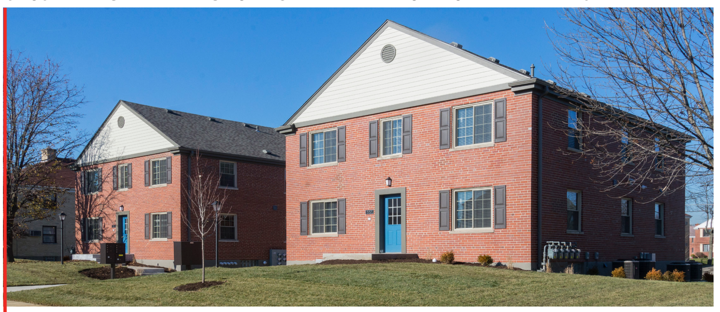
FRONT ELEVATION OF 551/557 CORONA AVE. AFTER MODERNIZATION EFFORTS

Greater Dayton Construction Group is in the final stages of modernizing four 4-family buildings located at 538 Telford Ave., and 550/551/557 Corona Ave. in Kettering, Ohio.