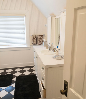
BEFORE PHOTOS OF GUEST BATHROOM AT THE SCHEAR RESIDENCE