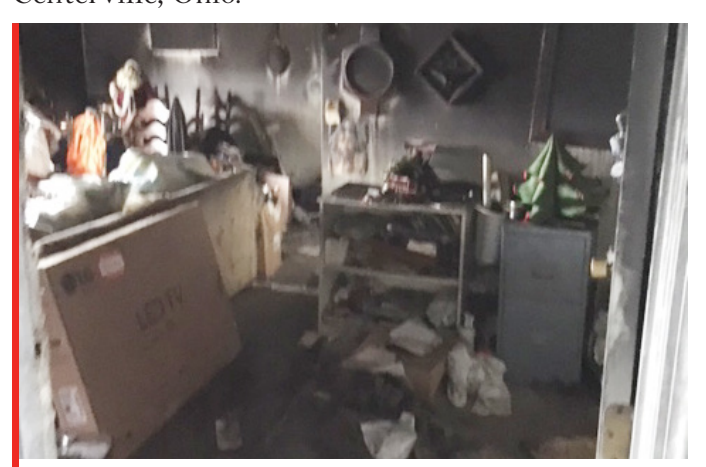
INTERIOR DAMAGE AT CENTERVILLE APARTMENT COMPLEX AFTER FIRE LOSS

Earlier this month, Greater Dayton Construction Group's Emergency Response Team (ERT) responded to a fire loss at a 12-unit apartment complex in Centerville, Ohio.