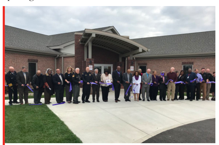
PROJECT C.U.R.E. RIBBON-CUTTING CEREMONY

On Thursday, November 2<sup>nd</sup>, Project C.U.R.E., Inc. hosted a ribbon-cutting ceremony to celebrate the opening of its new location, in Moraine, Ohio.