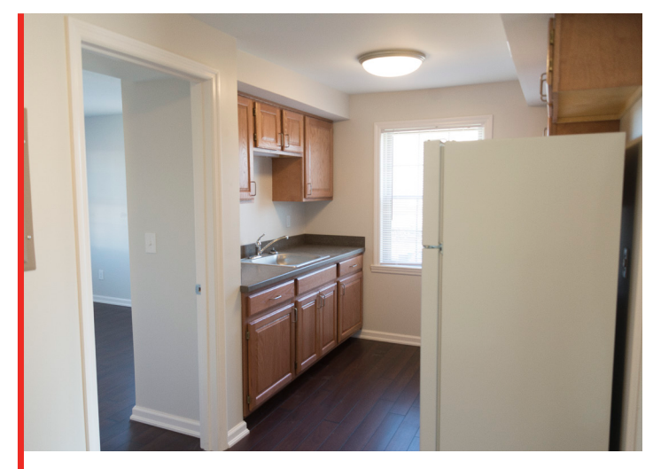
AFTER PHOTO OF KITCHEN AT 557 CORONA AVE.

Greater Dayton Construction Group is in the final stages of modernizing four 4-family buildings located at 538 Telford Ave., and 550/551/557 Corona Ave. in Kettering, Ohio.