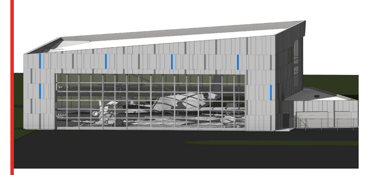
PROPOSED RENDERING OF CONNOR GROUP AIRPORT HANGAR

Oberer Thompson Company has started construction on a \pm 17,200 sqft. airport hangar for The Connor Group.