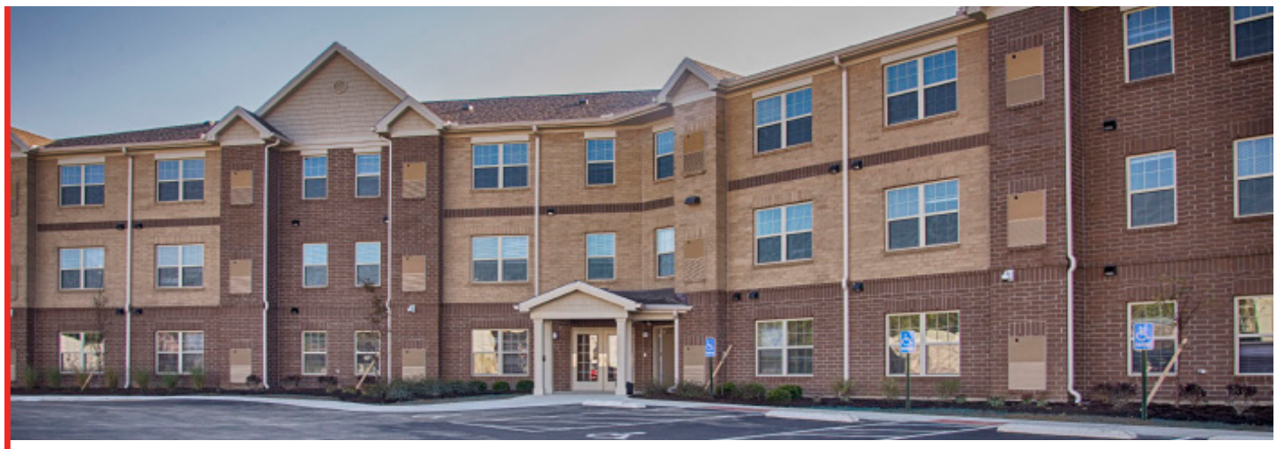
FRONT ELEVATION OF KEY TERRACE HOUSING DEVELOPMENT IN KETTERING, OHIO

After a year of meeting tight deadlines and countless hours dedicated by the project team, Oberer Thompson Company has completed the construction of the Key Terrace housing development in Kettering, Ohio.