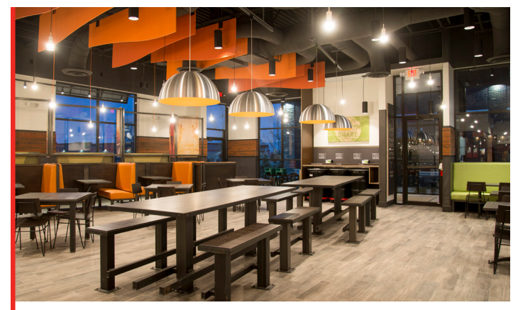
PHOTO OF CORELIFE EATERY MAIN DINING ROOM

Oberer Thompson Company has substantially completed the construction of CoreLife Eatery in Centerville, Ohio.