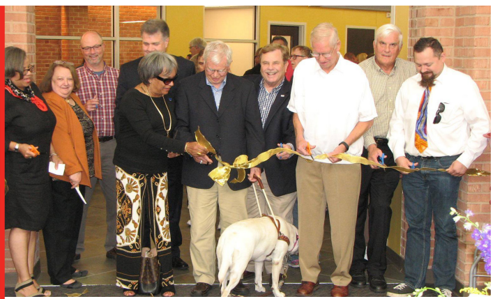
RIBBON CUTTING CEREMONY AT CLARK COUNTY PUBLIC LIBRARY

On Thursday, September 28<sup>th</sup>, Clark County Public Library hosted a ribbon-cutting ceremony to celebrate the grand re-opening of its renovated/ expanded building.