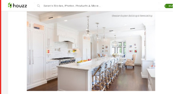
Flecked or softly veined white countertops are good for you if:

The upgraded kitchen now features an eat-in island, custom white cabinetry, quartz countertops, and a subway tile backsplash.