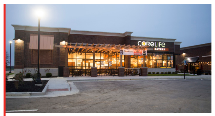
PHOTO OF CORELIFE EATERY EXTERIOR

Finishes include: ceramic wall tile, wood wall coverings, and vinyl plank flooring. The restaurant is projected to seat 62 patrons inside as well as up to 40 patrons on the patio.