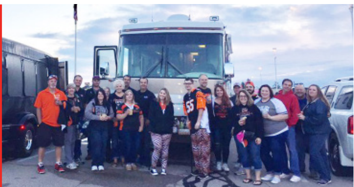
TAILGATERS POSE FOR A QUICK PHOTO BEFORE THE BENGALS GAME

The event featured beverages, cornhole, and – of course – good company. The Bengals were even able to pull out a victory (finally!) over the Buffalo Bills, with a score of 20–16.