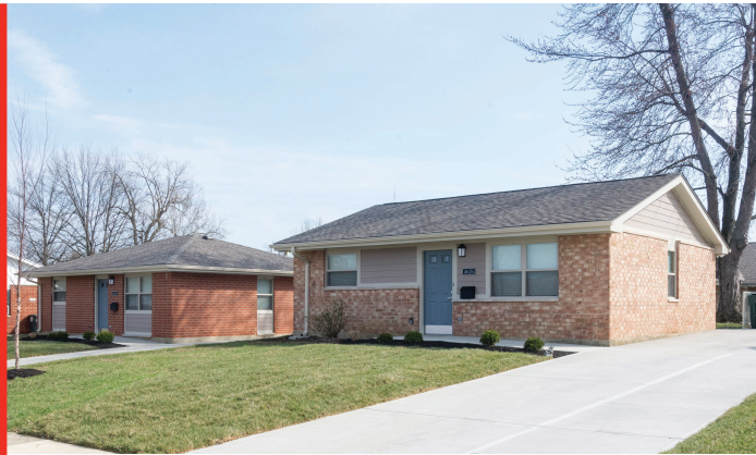
EXTERIOR PHOTO OF FRIDEN COURT HOMES

Oberer Thompson Company has substantially completed the modernization of five single-family Uniform Federal Accessibility Standards (UFAS) units at Friden Court located in Dayton, Ohio.