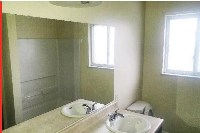
PHOTO OF HISLOPE BATHROOM AFTER RESTORATION EFFORTS

The +/- 2,000 sqft. structure suffered extensive damage after a fire ignited in the bathroom. The restoration scope included new attic insulation, drywall, flooring, and paint throughout the home.