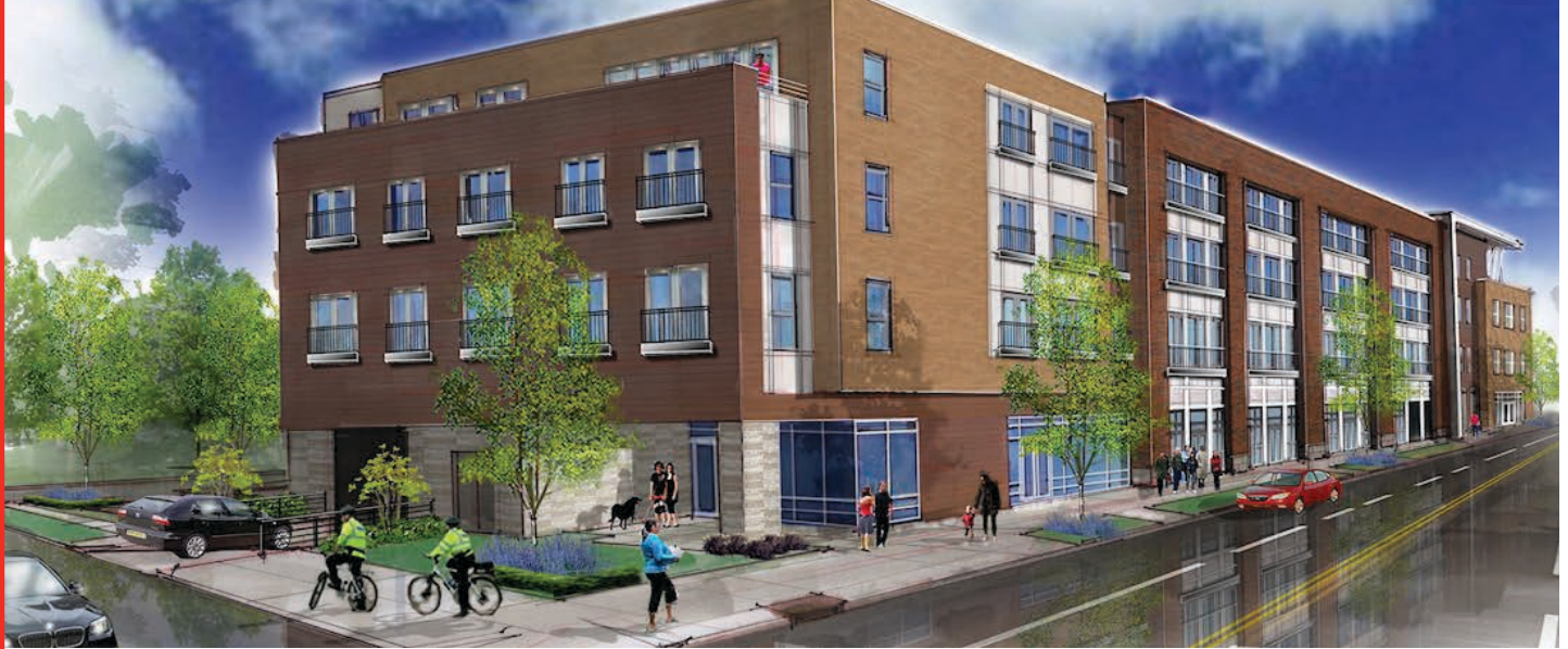
CONCEPTUAL RENDERING OF THE FLATS AT SOUTH PARK