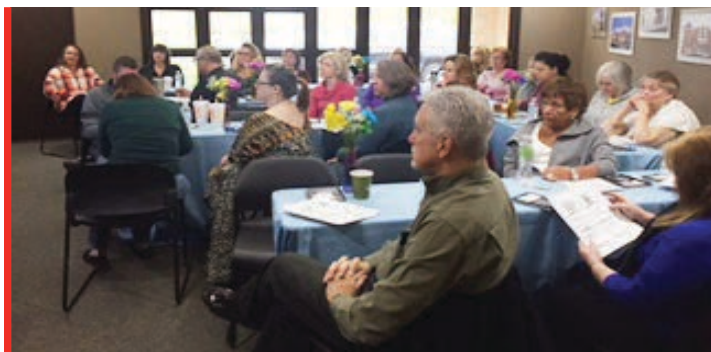
CE COURSE ATTENDEES LISTEN IN ON LECTURE

On Wednesday, March 29th, GDCG along with trade partner PuroClean Dayton, hosted two continuing education courses for those working in the insurance industry.