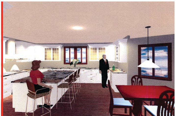
PROPOSED RENDERING OF MCINTOSH RENOVATION / ADDITION -RENDERING COURTESY OF MODA4 DESIGN

GDB&R worked with the McIntosh Family to develop a “Form meets Function” design what would meet the desires on their remodeling wish list. The project scope is scheduled to include the construction of a +/- 200 sqft. addition, as well as a full kitchen renovation.