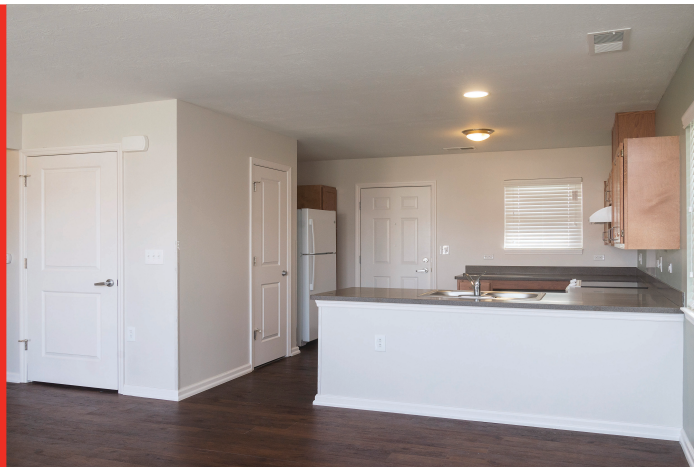
INTERIOR PHOTO OF FRIDEN COURT HOMES AFTER RENOVATIONS

The interior space of the +/-850 sqft. homes now feature an updated footprint (to accommodate UFAS considerations), new vinyl flooring, cabinetry, solid-surface countertops, ADA high-efficiency appliances, and roll-in showers. Exterior improvements include: new trim, roof, windows, and concrete flatwork.