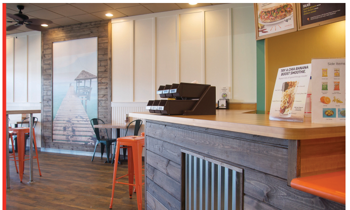
AFTER PHOTO OF NEW POINT OF SALES AREA

As part of a corporate reimagining initiative, the +/-1,600 sqft. space received interior upgrades to modernize the restaurant. The existing “island-themed” bamboo and berry-colored walls were removed and replaced by board & batten millwork and PVC beadboard wainscoting.