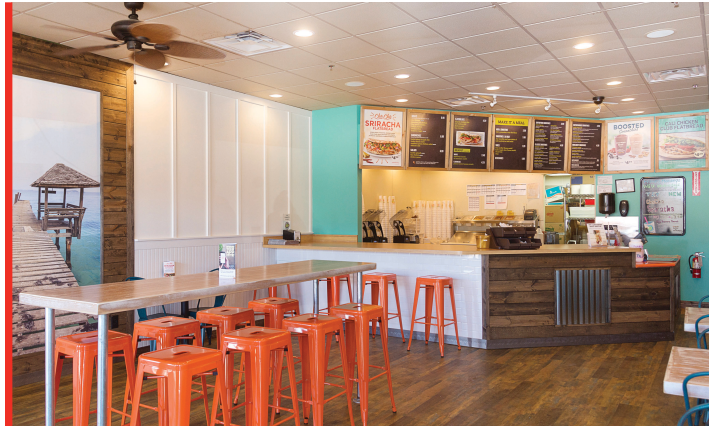
AFTER PHOTO OF TROPICAL SMOOTHIE CAFE

Earlier this month, OTC finalized renovations at Tropical Smoothie Cafe (OH-003), located at University Shoppes Plaza in Fairborn, Ohio.