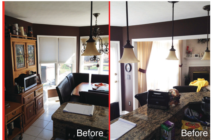
BEFORE PHOTOS OF MCINTOSH FAMILY KITCHEN

Earlier this year, the McIntosh family came to GDB&R with the hopes of renovating — and expanding — the existing kitchen in their beloved Centerville home.