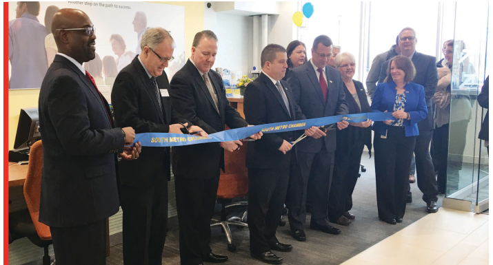
RIBBON-CUTTING CEREMONY AT FIRST FINANCIAL BANK

On Tuesday, March 14th, First Financial Bank at Cornerstone held a ribbon-cutting ceremony to celebrate the opening of its new branch location in Centerville, Ohio.