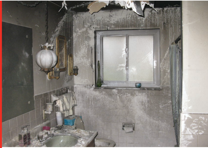
PHOTO OF HISLOPE BATHROOM AFTER FIRE LOSS

In December of 2016, Greater Dayton Construction Group's Emergency Response Team (ERT) responded to a house fire at the Hislope Residence in Xenia, Ohio.