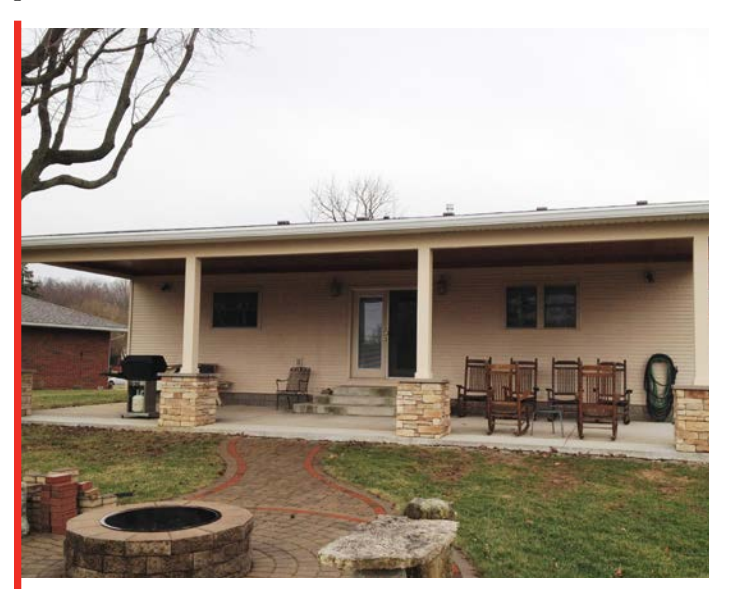
AFTER PHOTO OF ATKINSON PATIO RENOVATION

This is the second project GDB&R has performed for the Atkinsons, having previously completed a front porch renovation in 2011.