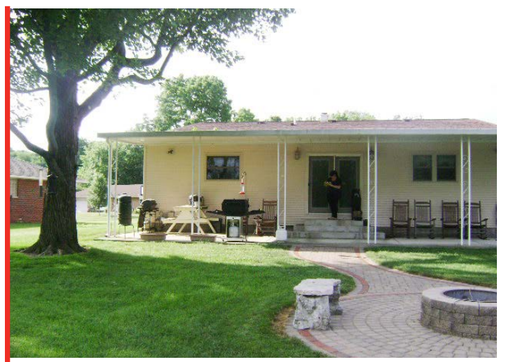
BEFORE PHOTO OF ATKINSON BACK PATIO

Earlier this month, Greater Dayton Building & Remodeling completed a rear patio extension for the Atkinson family in Dayton, Ohio.