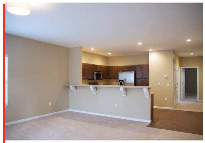
INTERIOR PHOTO OF LIVING ROOM AT TRADITIONS OF BEAVERCREEK

Exterior finishes include Hardie siding, and stone veneer column bases. Interior finishes include vinyl flooring, carpeting, and energy-efficient stainless steel appliances.