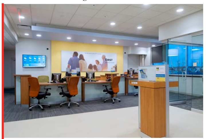
INTERIOR PHOTO OF BANK LOBBY

The new +/-2,800 sqft. building includes a lobby / waiting area, meeting rooms, office spaces, four teller stations, a break room, and a three-lane drive-thru with custom tube design.