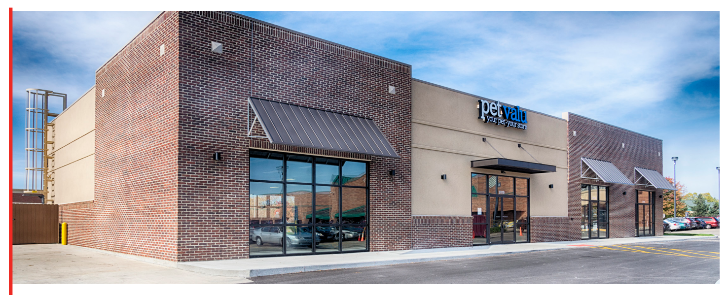
FRONT ELEVATION OF SHOPPES II LOCATED AT E. DAYTON YELLOW SPRINGS ROAD

Earlier this month, Oberer Thompson Company substantially completed construction efforts at the "Shoppes II" retail center located at the Valle Greene shopping complex in Fairborn, Ohio.