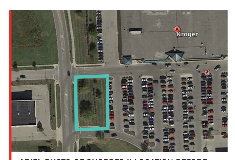
ARIEL PHOTO OF SHOPPES II LOCATION BEFORE CONSTRUCTION

In addition to the building shell work, OTC recently began construction on the interior build out for Pro Nail Salon. The project is scheduled to be completed later this year.