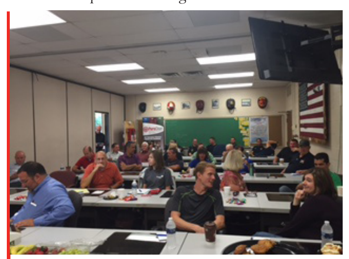
PHOTO OF LIVE BURN TRAINING ATTENDEES

The day included a live burning of two "Burn Cells", where participants had the opportunity to witness the flash of an electrical arc, watch as fire progression occurs and fire patterns emerge.