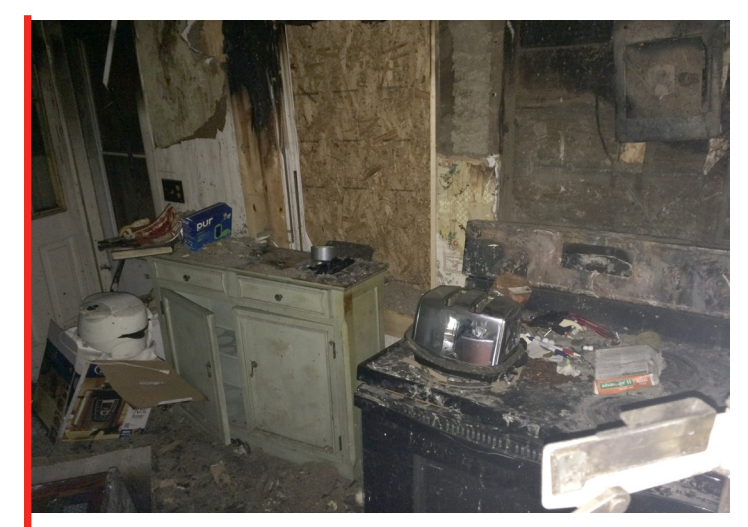
INTERIOR DAMAGE OF CURRENT RESIDENCE AFTER FIRE LOSS

In May of 2016, Greater Dayton Construction Group's Emergency Response Team (ERT) responded to a house fire at the Currrent Residence in Lewisburg, Ohio.