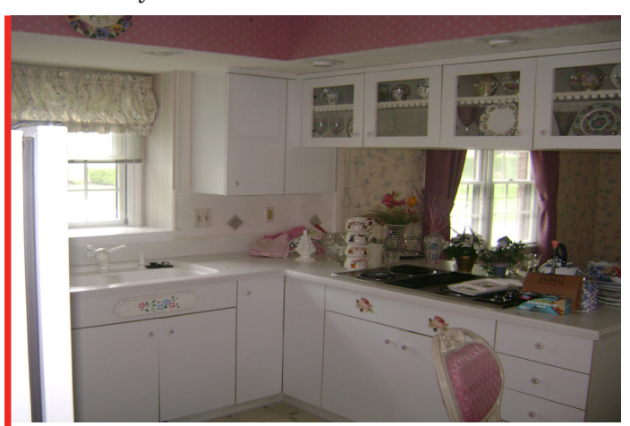
BEFORE PHOTO OF DEDARIO KITCHEN

GDB&R worked with the DeDario's to develop an "aging-in-place" design that would enhance both the functionality and aesthetic of their home.