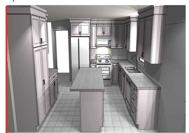
DESIGN RENDERING OF DEDARIO KITCHEN -RENDERING COURTESY OF BRIAN HAINES

Selections in the condo included: DuraSupreme cabinetry, LVT flooring, and Cambria Quartz countertops.