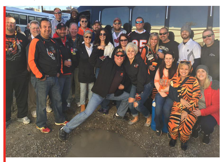
TAILGATERS POSE FOR A QUICK PHOTO BEFORE THE BENGALS GAME

The event featured beverages, cornhole, and – of course – good company. The Bengals were even able to pull out a victory (finally!) over the Cleveland Browns, with a score of 31-17.