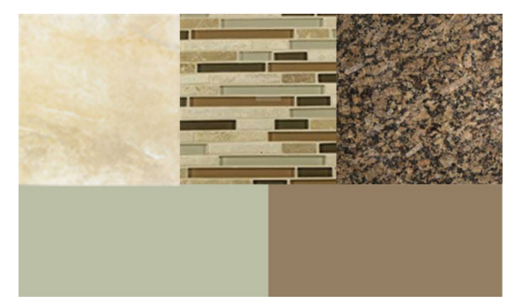
Copeland Remodeled Kitchen Selection Samples

Ms. Copeland selected a newer flooring product called Duraceramic. This tile has grown in popularity as it is warm under foot, has great stain resistance and is made of composite materials that are reminiscent of porcelain tile. The color palette for the project includes Sherwin Williams paint colors Sedate Gray and accent wall in Portebello. Amarillo Boreal granite countertops add depth while complementing the glass/stone backsplash. Stainless steel appliances will complete this sparkling new kitchen, scheduled for completion in late April.