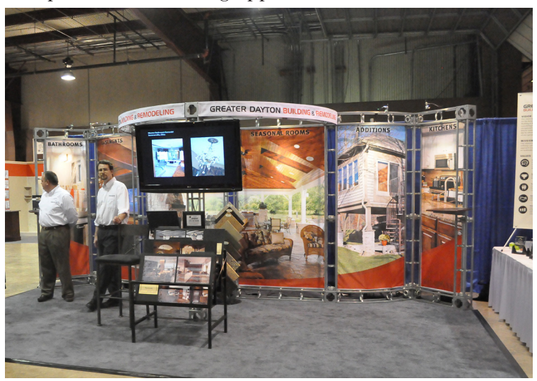
Miami Valley Home Improvement Show Truss Display

The annual Miami Valley Home Improvement Show was held earlier this month at Hara Arena. The four-day event was an opportunity to meet prospective customers and discuss possible remodeling opportunities.