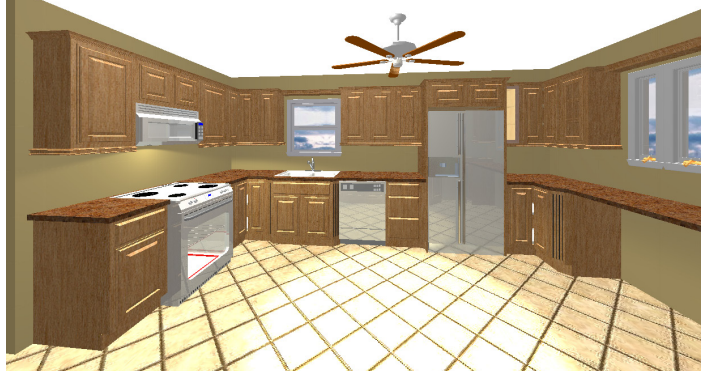
20/20 Copeland Kitchen Concept Rendering

Jill Copeland's existing kitchen lacked the form and function she desired. She came to Greater Dayton Building & Remodeling wanting a rejuvenated kitchen complete with additional cabinetry, granite countertops and a pass-through area to her living room. In addition to the new design, the installation of a new soffit, with recessed can lighting will be added to accent the granite bar below.