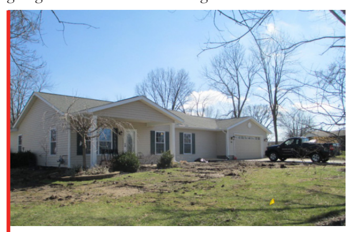
PROGRESS PHOTO OF FRONT ELEVATION AT BOWLING RESIDENCE

The new \pm /- 1,800 sqft. home now features three bedrooms, three bathrooms, an attached two-car garage and new finishes throughout.