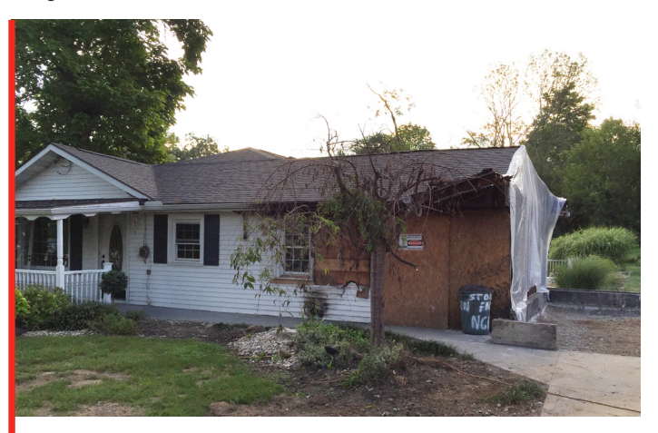
BOWLING RESIDENCE AFTER PARTIAL DEMOLITION - PHOTO COURTESY OF DAVE WILSON

Due to the extent of the damages sustained during the fire, and existing building conditions (termite damage), the structure was ruled a total loss and required full reconstruction efforts.