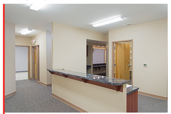
PHOTO OF NURSES STATION AT C.I.C.

Oberer Thompson Company has substantially completed construction efforts at Clinical Inquest Center (C.I.C.) in Beavercreek, Ohio.