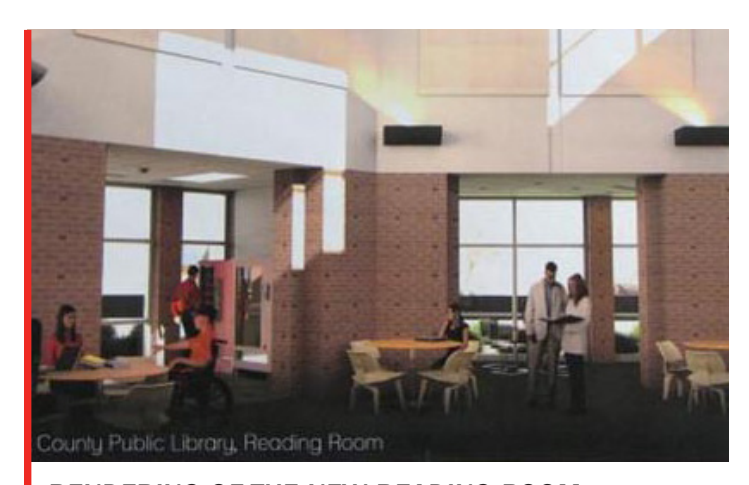
RENDERING OF THE NEW READING ROOM

The robust renovation scope is scheduled to include: a recreated entrance, the addition of meeting/group/study/reading rooms, a tech-training room, updated restrooms, and energy-efficient mechanical systems upgrades.