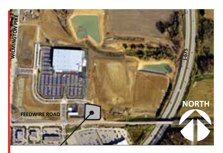
AERIAL PHOTO OF CORNERSTONE DEVELOPMENT ("SHOPPES II" LOCATION IN GRAY)

In addition to Shoppes I (completed in late 2015) and II, OTC is also in the preliminary planning phases of "Shoppes III" — a third, +/- 10,000 sqft. retail center at Cornerstone — scheduled to begin in early summer.