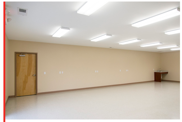
PHOTO OF LAB TESTING AREA AT C.I.C.

The medical space is approximately 5,800 sqft. and features a waiting room, nine exam rooms, a testing lab, a conference room, two doctors' offices, a nurses station and storage area.