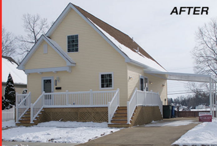
BEFORE AND AFTER EXTERIOR PHOTOS OF THE WHITE RESIDENCE