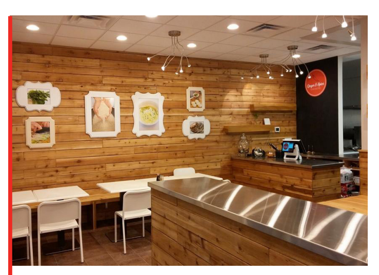
INTERIOR PHOTO OF GINGER AND SPICE ASIAN BISTRO AFTER RENOVATION EFFORTS

Renovations to the restaurant included: the build-out of a dining room (with seating for 25-30 people), two restrooms, a new roof-top HVAC unit, modifications for increased gas service and the installation of front elevation signage. Kitchen upgrades to the space included a new walk-in freezer and range hood.