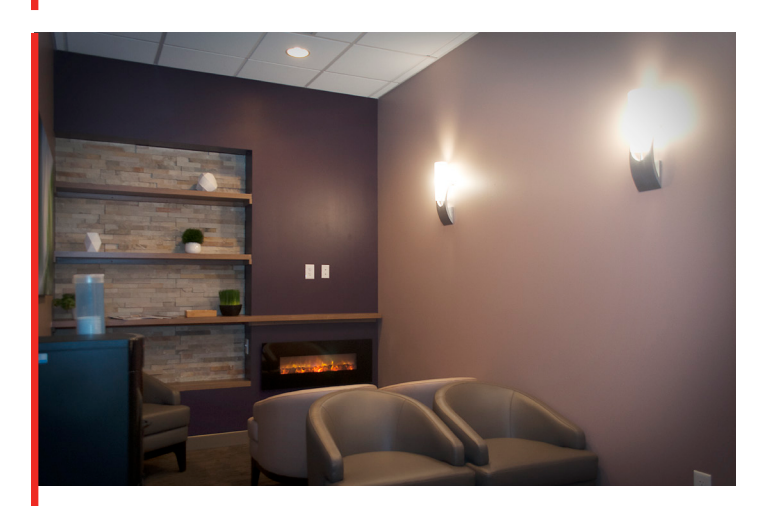
TRANQUILITY ROOM AT MASSAGE ENVY SPA IN COLERAIN