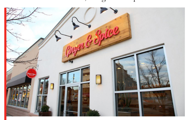
EXTERIOR OF GINGER AND SPICE ASIAN BISTRO

Earlier this year, Oberer Thompson Company provided construction services for the Dayton Area's newest Asian restaurant, Ginger and Spice.