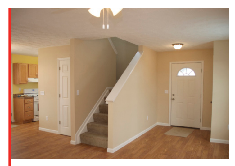
INTERIOR PHOTO OF WHITE RESIDENCE AFTER RESTORATION EFFORTS

The new home now features one and a half bath-rooms, three bedrooms, and is approximately 1,500 sqft.