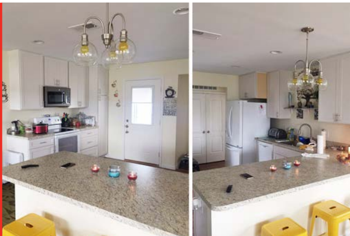
AFTER PHOTOS OF ADAMS' RESIDENCE

The newly restored three bedroom, one bathroom home is now complete, and features new flooring, paint, and updated mechanical systems. In addition to a reconfigured floorplan, the residence also received an updated porch with gable roof.