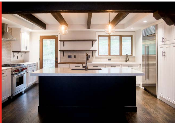
AFTER PHOTO OF STITSINGER KITCHEN