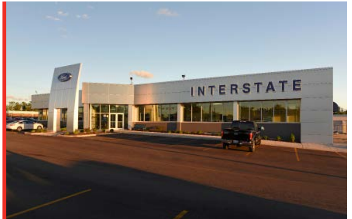
AFTER PHOTO OF INTERSTATE FORD

GDB&R was recognized in the Commercial Specialty category for the project at Interstate Ford in Miamisburg, Ohio.