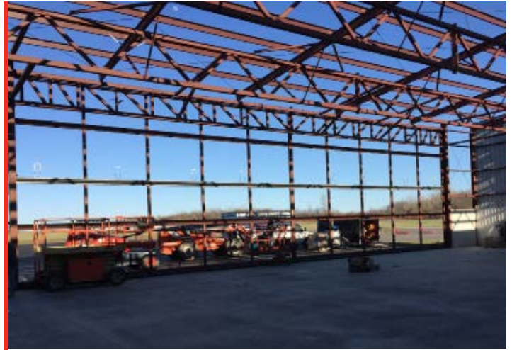
PROGRESS PHOTO OF NEW AIRPORT HANGAR AT LEWIS A. JACKSON AIRPORT

Oberer Thompson Company has substantially completed a +/- 7,500 sqft. airport hangar at Lewis A. Jackson Regional Airport in Xenia, Ohio.