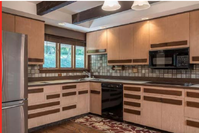
BEFORE PHOTO OF STITSINGER KITCHEN

Greater Dayton Building & Remodeling has recently wrapped up a kitchen renovation in Oakwood, Ohio.