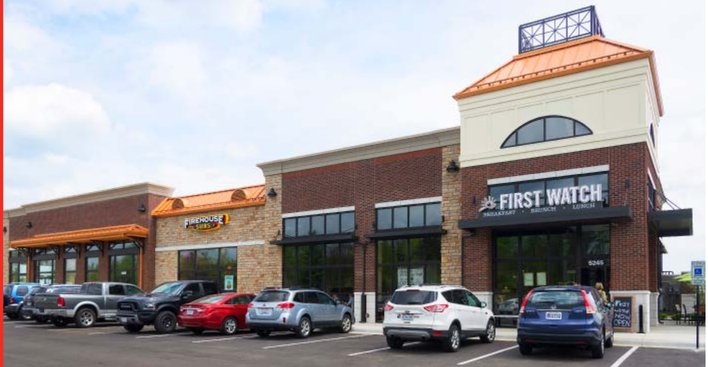
FRONT ELEVATION OF “SHOPPES III” AT CORNERSTONE DEVELOPMENT IN CENTERVILLE