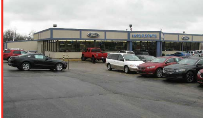
BEFORE PHOTO OF INTERSTATE FORD

On Friday, April 7th, during the “Evening of Excellence” in Scottsdale, Arizona, Greater Dayton Building & Remodeling was awarded a National “Contractor of the Year” (CotY) Award by the National Association of the Remodeling Industry (NARI).