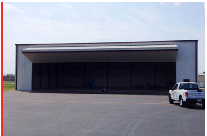
AFTER PHOTO OF AIRPORT HANGAR

The project scope also included minor landscaping (seeding and mulching) to surrounding areas.