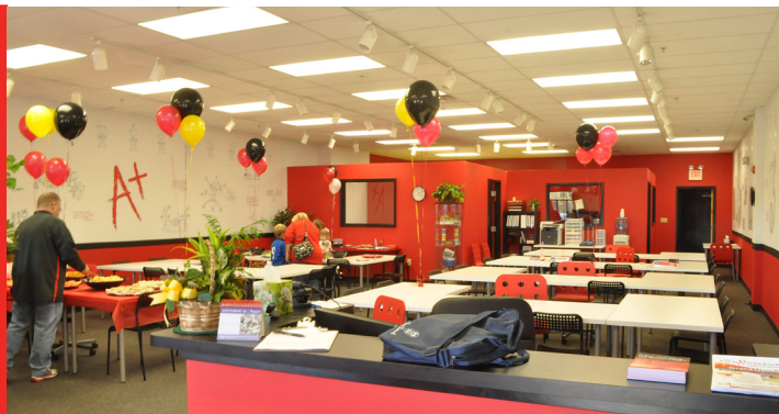
MATHNASIUM OF CENTERVILLE'S LEARNING SPACE

The project's build out scope included: office space, storage rooms and restrooms. Interior finishes featured new paint, carpet and trim work.