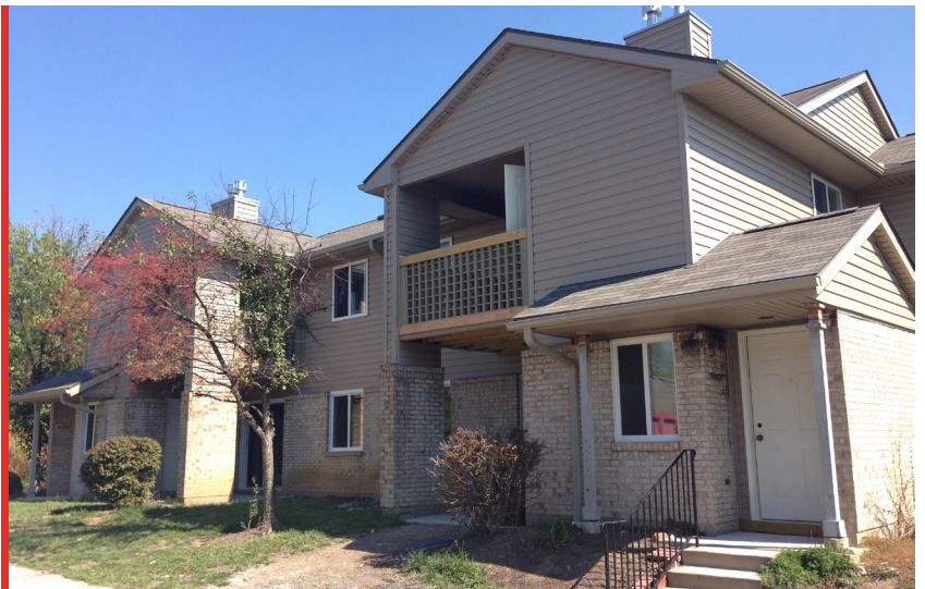
EXTERIOR OF BUILDING 29 AFTER COMPLETED RESTORATION EFFORTS

GDCG has been working swiftly towards the project's scheduled completion date in December.