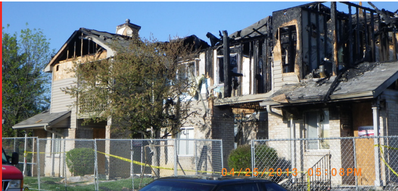
FIRE LOSS AT BUILDING #29 AT MILL POND APARTMENT COMMUNITY

Greater Dayton Construction Group's Emergency Response Team responded to a fire loss at the Mill Pond Apartment Community in Bellbrook, Ohio on April 25, 2013.