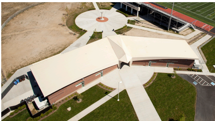
AERIAL PHOTO OF EATON’S WELLNESS COMPLEX

If you have a project that would photograph especially well aerially, contact Perfect Perspectives at www.perfectperspectivesaerial.com for a quote or see External Communications Coordinator, Caroline Morgan.