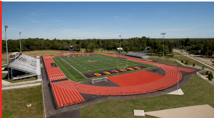
AERIAL PHOTO OF PHASE I OF EATON’S ATHLETIC FACILITY

As part of GDCG’s ongoing marketing efforts and project documentation, we once again seized the opportunity to work with the company when it came time to capture photos of Eaton Highschool’s recently completed Athletic Facility and Wellness Complex.