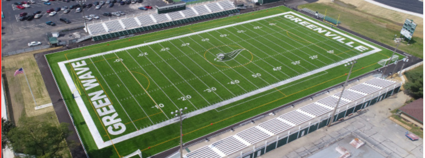
AERIAL PHOTO OF RENOVATED HARMON FIELD AT GREENVILLE HIGH SCHOOL