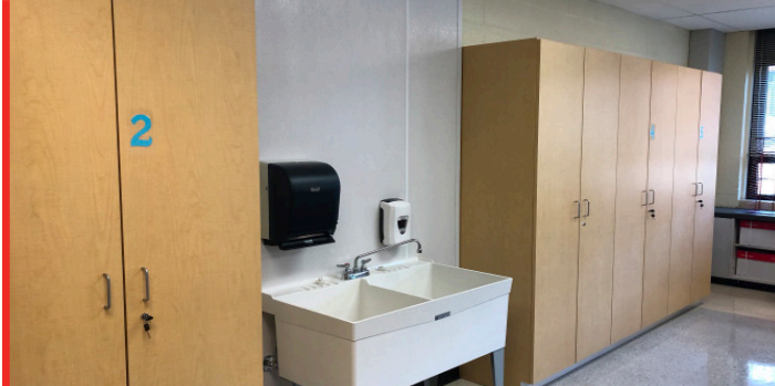
NEW STORAGE CABINETS AT SHAW ELEMENTARY

Oberer Thompson Company has substantially completed six “museum-inspired” learning space renovations at each of the elementary schools within Beavercreek City School District (Main, Fairbrook, Parkwood, Trebein, Shaw, and Valley Elementary).