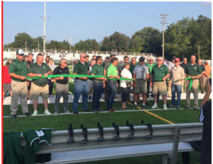
HARMON FIELD DEDICATION / RIBBON CUTTING CEREMONY

The new track and field area — scheduled to be completed later this fall — will include grandstands (1,000+ seats), Musco sports lighting, the installation of an irrigation system, scoreboard, pressbox, and fencing.