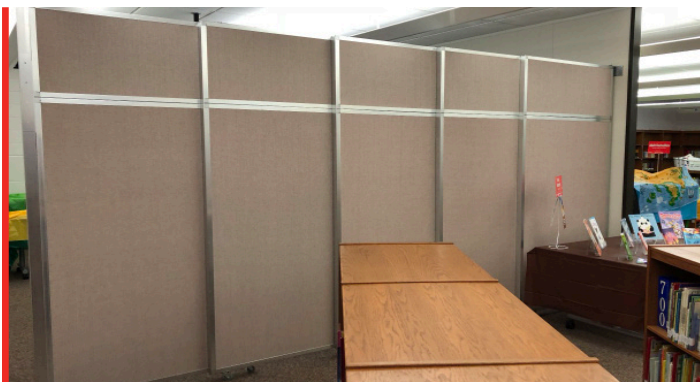
NEW SLIDING PARTITION WALL AT PARKWOOD ELEMENTARY

In an effort to provide a “museum-like” environment for students, the spaces are now highlighted by new Velcro and bulletin board displays, display cases, updated storage cabinets, as well as new paint and flooring in select areas.