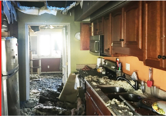
PHOTO OF INTERIOR FIRE DAMAGE AT BAKER HOME

In August, Greater Dayton Construction Group's Emergency Response Team (ERT) responded to a house fire at the Baker Residence in Kettering, Ohio.