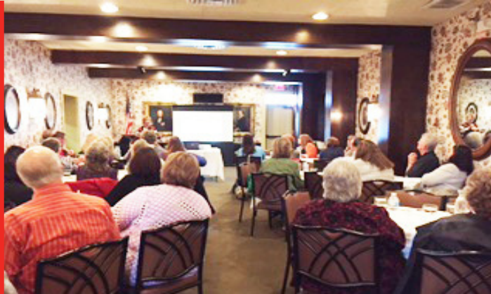
INSURANCE PROFESSIONALS ATTEND CONTINUING EDUCATION COURSE AT THE GOLDEN LAMB

The courses were hosted at The Golden Lamb in Lebanon, Ohio, and focused on Toxic Mold Remediation and Disaster Safety Planning.