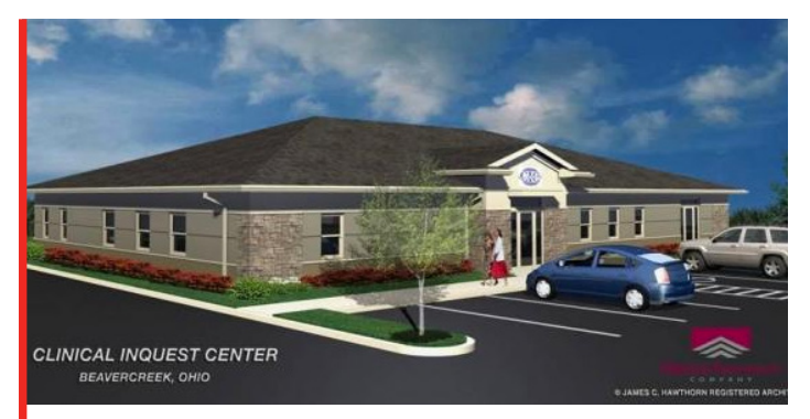
PROPOSED RENDERING OF CIC'S NEW MEDICAL BUILDING IN BEAVERCREEK

Earlier this month, Oberer Thompson Company hosted a ground-breaking ceremony to celebrate the commencement of construction at Clinical Inquest Center's new medical space in Beavercreek.