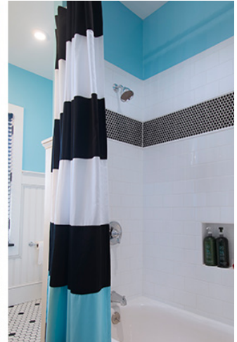
HALL BATHROOM RENOVATION AT DEUTSCH RESIDENCE