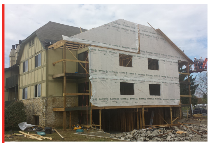
PROGRESS PHOTO OF WEST FACADE RECONSTRUC-TION

As only the eastern half of the building is scheduled to remain, GDCG will modify the existing structure so that the fire wall that once separated the two halves will now serve as the western exterior elevation (photo below).