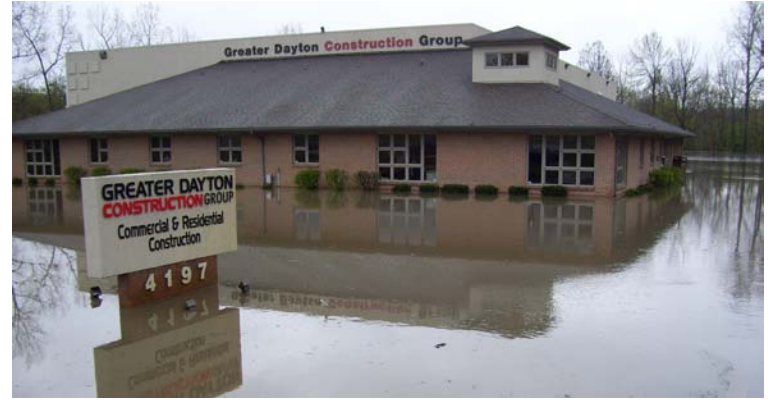
GDCG Home Office 4/19 at 3:15 p.m.

On the heels of one of the harshest winters in recent memory, the Miami Valley endured record levels of precipitation to begin spring. The statistics for the month of April are staggering. In the 30-day period, Dayton was hammered with 10.48 inches or rain—nearly double the monthly average of 5.76 inches.