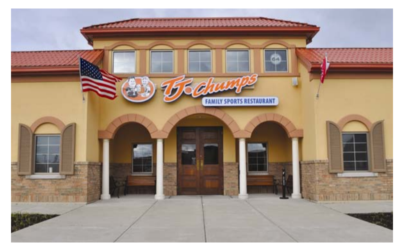
TJ Chumps (Dayton-Yellow Springs Rd.) — Photo courtesy of Caroline Morgan

The project was successfully completed on a strict timeline, and featured heavy mechanical, electrical, and gas service modifications for the expanded kitchen. Renovations to the waiting and bar areas opened up the space to help create the open floor plan, while multiple TVs were added to achieve the real "sports bar" feel.