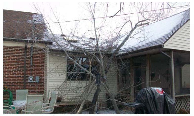
Example of Ice Damage at the Wilson Residence in Kettering

In all, the Insurance Division received 160 claims in February followed by 133 in March, with a majority of the necessary repair work stemming from the ice storm. Damage experienced ranged from large structure repairs to smaller siding and roofing issues, with the most dangerous situations being created by overhead power lines and electric meters damaged by tree branches (many times pulling them loose from the house).