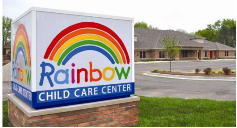
Rainbow Child Care Center (Washington Twp.)

Satisfied with the project, RCDC awarded OTC an identical project in Beavercreek, located at the corner of New Germany-Trebein and Lillian Lane. Construction is currently underway.