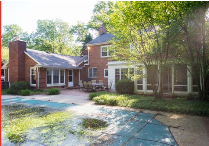
BEFORE PHOTO OF REAR ELEVATION AT MOBLEY RESIDENCE

Greater Dayton Building & Remodeling recently began renovation efforts on the Mobley Residence in Centerville, Ohio.