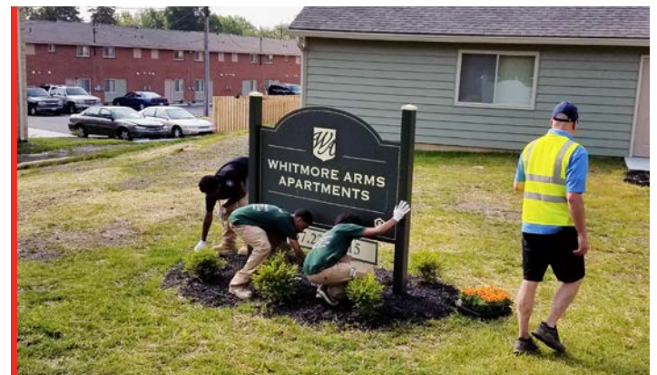
YOUTHBUILD VOLUNTEERS PLANT FLOWERS AT WHITMORE ARMS

Volunteers spent the day planting flowers, spreading topsoil, and seeding lawns.