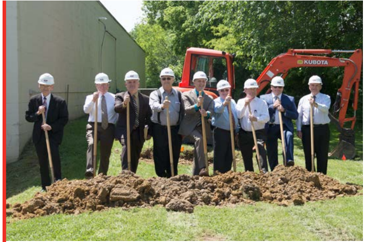
MEMBERS OF FELLOWSHIP TRACT LEAGUE POSE FOR A PHOTO DURING THE GROUND BREAKING

The faith-based printing organization, Fellowship Tract League, recently hosted a groundbreaking ceremony to celebrate the start of construction on its facility's new addition / renovation in Morrow, Ohio.