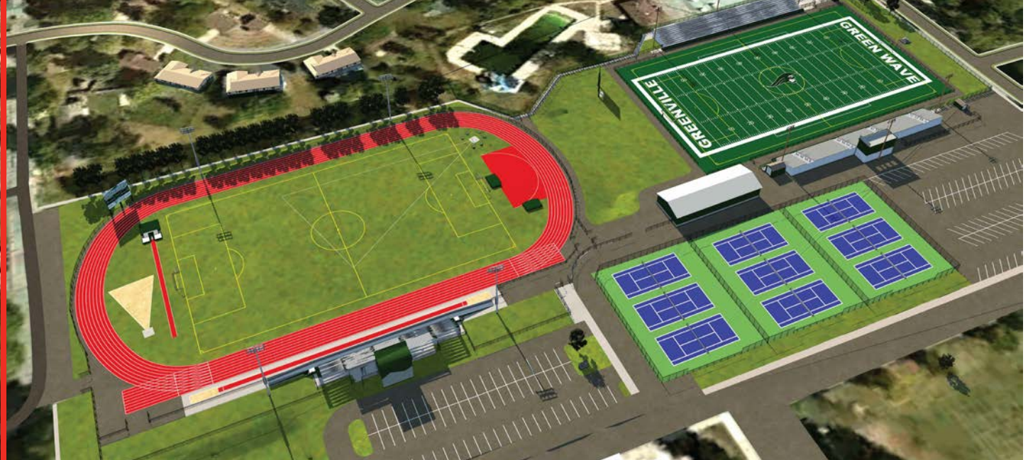
RENDERING OF GREENVILLE CITY SCHOOL'S NEW TRACK AND FIELD COMPLEX

-RENDERING COURTESY OF CIVIL AND ENGINEERING CONSULTANTS, INC. (CEC)