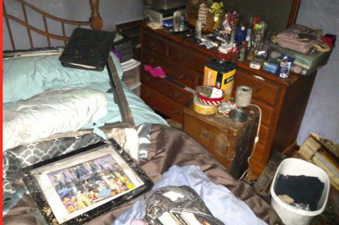
BEDROOM IN MOORE RESIDENCE AFTER FIRE LOSS

Earlier this Spring, the Moore Residence in Jeffersonville, Ohio, suffered extensive fire damage to their +/- 2,400 sqft. home when a baseboard heater ignited and caused a fire to spread quickly throughout the residence.