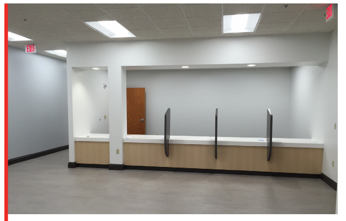
PHOTO OF PHASE I RECEPTION AREA AT MONT-GOMERY COUNTY JOB CENTER

Oberer Thompson Company has substantially completed Phase I renovations at Montgomery County Job Center in Dayton, Ohio.