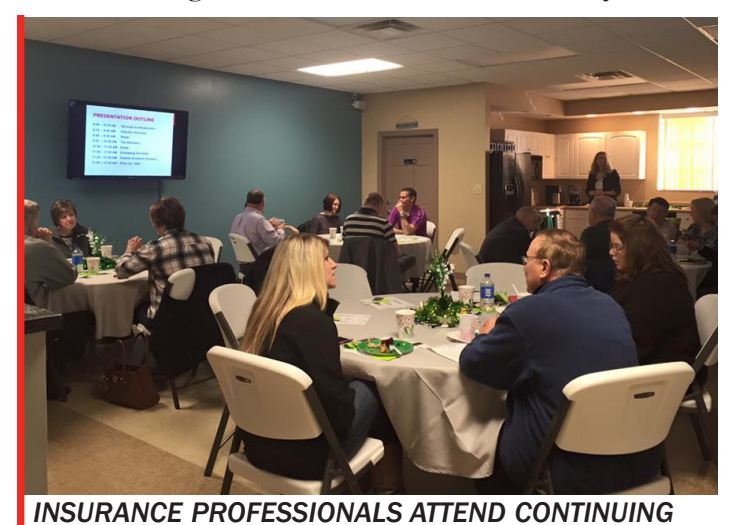
EDUCATION COURSE AT ALLSERV

On March 8th, GDCG — along with trade partner AllServ— hosted a continuing education course for those working in the home insurance industry.