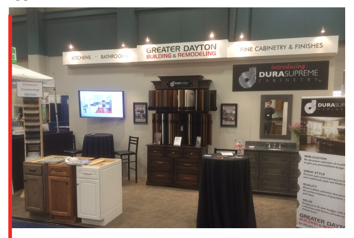
PHOTO OF BUILDING AND REMODELING BOOTH AT DAYTON HOME AND GARDEN SHOW

Exhibitors at the event showcased the latest in home improvement, outdoor living, kitchen and bath design, and culinary demonstrations. The three-day show was an opportunity for GDB&R to meet prospective customers and discuss possible remodeling opportunities.