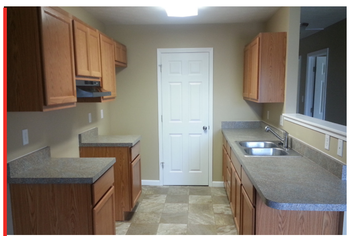
PHOTO OF KITCHEN AFTER RESTORATION EFFORTS

The project scope included the installation of new mechanical systems, insulation, flooring, cabinetry, and doors. Exterior repairs included a new roof, siding, and windows.