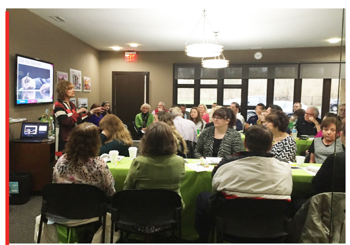
INSURANCE PROFESSIONALS ATTEND CONTINUING EDUCATION COURSE AT GDCG

Attendees from both days donated items to Blue Star Mothers – a non-profit organization that supports mothers who have children serving in the U.S. Armed Forces.