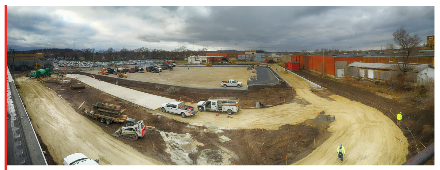
PROGRESS PHOTO OF NEW PARKING LOT AND BUS TURNAROUND (JANUARY 2016)