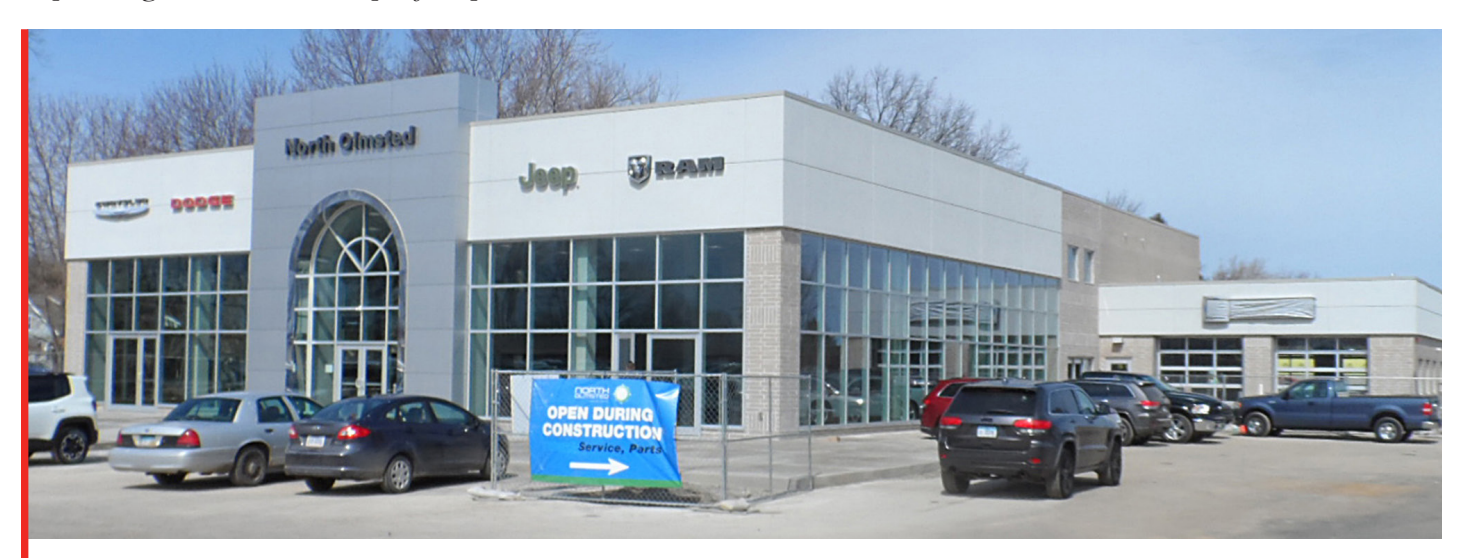
FRONT ELEVATION OF NEW SHOWROOM AT NORTH OLMSTED CHRSYLER DODGE JEEP RAM AUTO DEALERSHIP

Oberer Thompson Company has reached a project milestone on the multi-phase North Olmsted Chrysler Dodge Jeep Ram Auto Dealership. The project was awarded to OTC in July 2014, adding to its expanding Northern Ohio project portfolio.