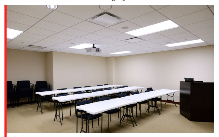
RENOVATED SEMINAR ROOM AT MORGAN STANLEY

Finishes in the space included: new doors, trim work, frosted glass panels, and energy-efficient lighting. In addition to the expansion, OTC also renovated a seminar room in the existing space.