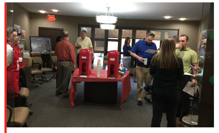
GDCG EMPLOYEES GATHERED FOR COFFEE COURTESY OF THE DAYTON-AREA RED CROSS

Special thanks to the Red Cross for the kind gesture and for its on-going support of the Dayton Community!