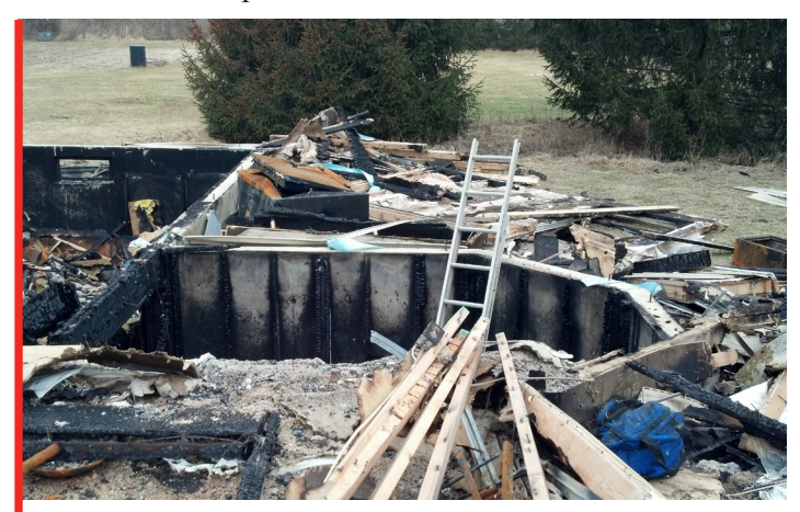
TUDOR RESIDENCE AFTER FIRE DAMAGES

Upon initial inspection, the structure was ruled a total loss, needing full reconstruction efforts to meet current code requirements.