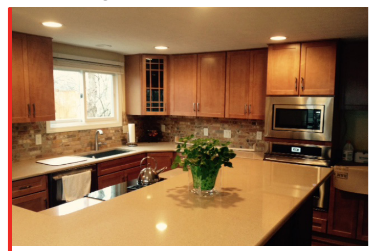
THE MACKE'S NEWLY RENOVATED KITCHEN

After weighing their options, the Macke's decided to move forward with the renovation and a new contract, including the structural repairs, was prepared.