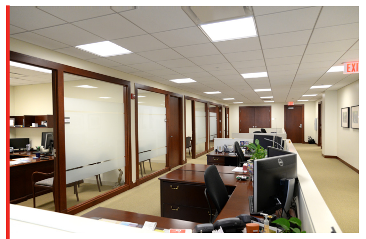
MORGAN STANLEY OFFICE EXPANSION AT THE GREENE

The project's expansion scope included the build-out of 10 offices, a conference room, break room and copy area — totaling +/- 2,700 sqft.