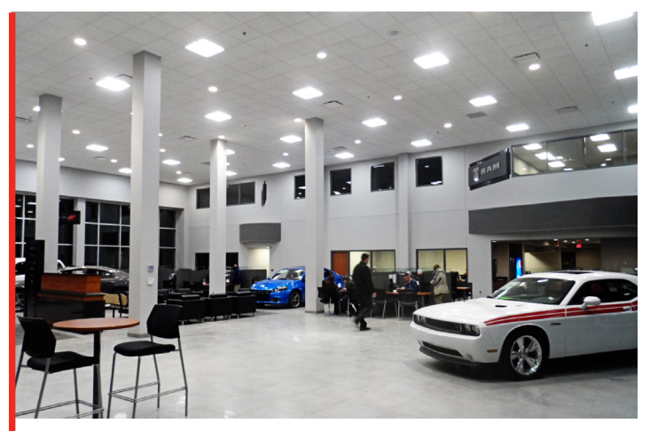
INTERIOR OF NEW SHOWROOM AT NORTH OLMSTED CHRYSLER DODGE JEEP RAM

To date, OTC has redeveloped the existing site and substantially completed construction on the new two-story showroom / service reception building (+/- 18,600 sqft.).