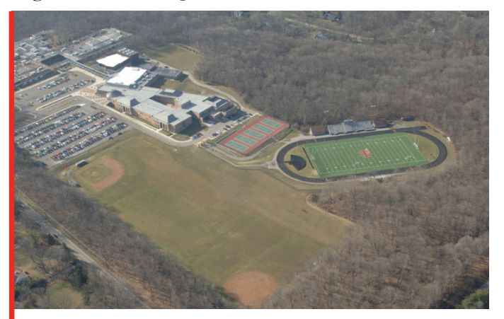
AERIAL PHOTO (BEFORE RENOVATIONS) OF INDIAN VIL-LAGE ATHLETIC COMPLEX

The renovation scope for this project is scheduled to include: demolition of existing ballfields, construction of one baseball and one softball field with synthetic turf infield, irrigated outfield, masonry dugouts & backstops, and scoreboards.