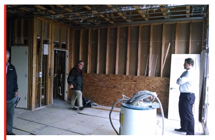
APARTMENT UNIT AT THE GREENE AFTER DEMOLITION EFFORTS

Greater Dayton Construction Group has finalized renovation efforts that began in April on a set of apartment units that suffered extensive water damage at The Greene Shopping Center.