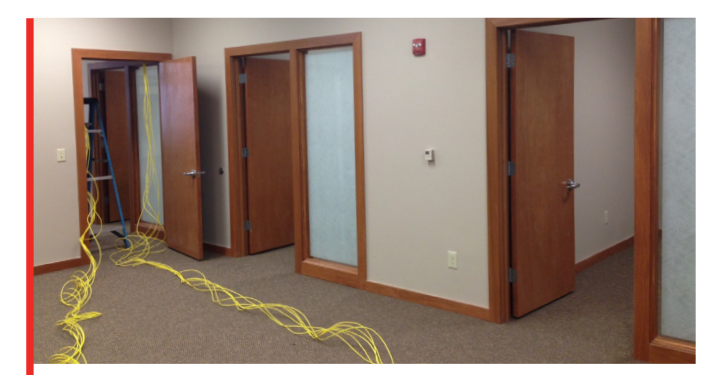
IN PROGRESS PHOTO OF NEW OFFICE SPACES AT NORTHWESTERN MUTUAL

The project's scope included the build out of seven offices, nine intern work areas, and a hallway to connect the existing offices to the expansion. OTC also provided construction services for a new beverage bar and corner desk in the existing Northwestern Mutual space.