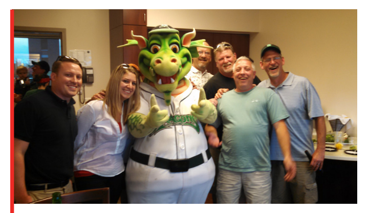
GDB&R EMPLOYEES POSE WITH HEATER FOR A QUICK PHOTO

In addition to enjoying good food and beverages, the employees celebrated a Dragons win over the Bowling Green Hot Rods! Thank you to those who helped contribute to the evening's success.