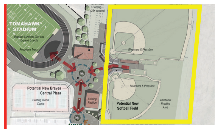
RENDERING OF PHASE ONE RENOVATIONS OUTLINED IN YELLOW

Construction work will also include grandstands located behind the backstops, a multi-purpose field, and shot put area. The project is scheduled for