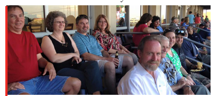
GAME ATTENDEES POSE FOR A QUICK PHOTO DUR-ING THE BALL GAME

On Monday, June 15, Greater Dayton Construction Group hosted an evening out at the ballpark for those in the home insurance industry.