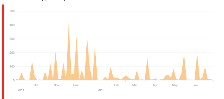
GRAPH OF GDB&R'S POST REACH FROM SEPT. 2014 TO JUNE 2015

Additionally, GDCG and GDB&R have made over 135 Facebook posts since Sept. 2014, and as a result have received over 33,797 page post impressions (viral and organic).