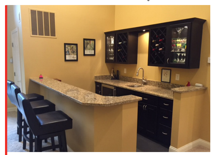
AFTER PHOTO OF BAR RENOVATION AT BOSE RESIDENCE

Selections included granite countertops, brushed nickel fixtures, and Merillat Cabinetry in a Java finish.