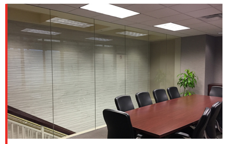
AFTER PHOTO OF A NEW CONFERENCE ROOM AT DINSMORE & SHOHL'S DOWNTOWN DAYTON OFFICE