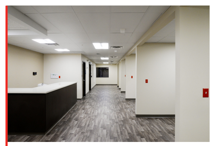
AFTER PHOTO OF PRE / POST OP. AREA AT SURGICAL CENTER

The +/- 8,000 sqft. tenant improvement project included: the relocation of existing restrooms, the build out of seven pre/post operation waiting areas, a nurses' station, two waiting rooms, office areas, three exam rooms, a minor procedure room and an operation room.