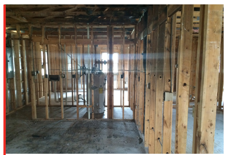
PROGRESS PHOTO OF KITCHEN DURING RESTORATION EFFORTS (BEFORE SPRAY SEAL)

After temporarily securing the property, GDCG's estimating and production teams quickly got to work to begin the restoration process.