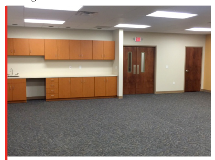
PHOTO OF TRAINING ROOM AT DAVITA DIALYSIS

Located at 7769 Old Country Lane, the \pm 2,300 sqft. renovation included the build out of a training room, kitchenette, several office spaces, and a model training station.