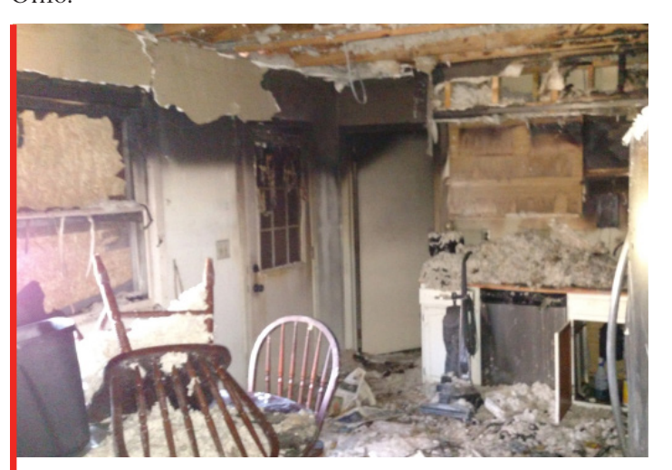
PHOTO OF KNOX KITCHEN AFTER FIRE LOSS

In December of 2015, Greater Dayton Construction Group's Emergency Response Team (ERT) responded to a house fire at the Knox Residence in St. Paris, Ohio.