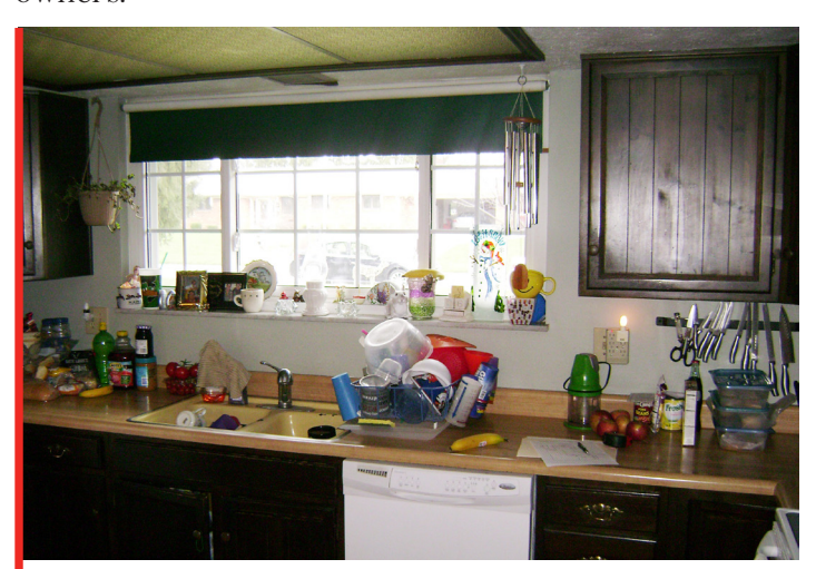
KIPLER KITCHEN BEFORE RENOVATIONS

Greater Dayton Building & Remodeling has finalized renovation efforts at the Kipler residence and has recently turned the project over to the happy homeowners.