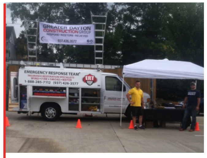
GDCG DISPLAYS THE EMERGENCY RESPONSE VEHICLE DURING THE CINCINNATI RED CROSS DISASTER FAIR

On Saturday, August 23, the American Red Cross Cincinnati-Area Chapter and Hamilton County teamed up to host a Disaster Preparedness Fair. Over 30 agencies were present to help show families how to respond during and after a disaster, along with steps families can take to prepare for a safe response plan. During the fair, families learned how to create disaster kits using items already found in their home.