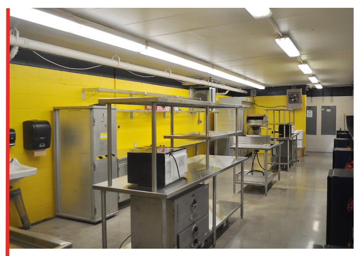
PHOTO OF CONCESSION STAND AFTER RENOVATION EFFORTS

Renovations to the concession stand included: custom fabricated stainless-steel countertops, new overhead doors (for the order windows), new electrical and plumbing systems, shelving, cabinetry, and a refinished concrete floor. In addition, OTC painted the space black and yellow to keep with the school spirit!