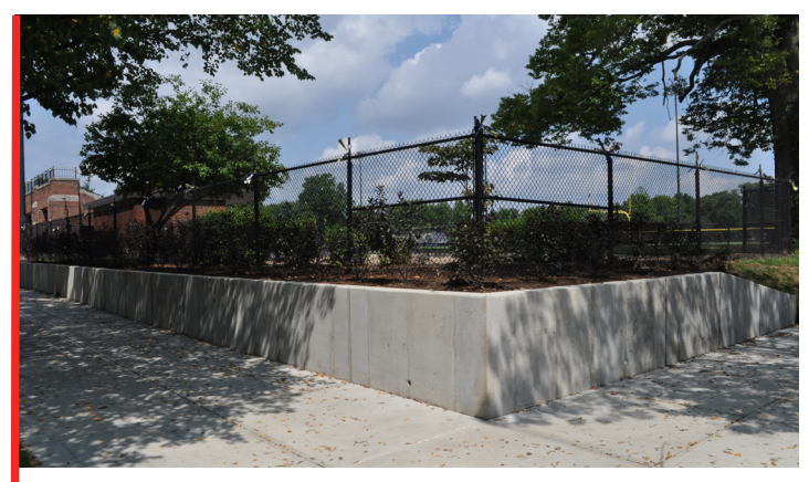
AFTER PHOTO OF OAKWOOD HIGH SCHOOL WITH RETAINING WALL

Additionally, OTC oversaw the installation of a retaining wall (approx. 200 lineal feet) as well as 1,200 sqft. of sidewalk.