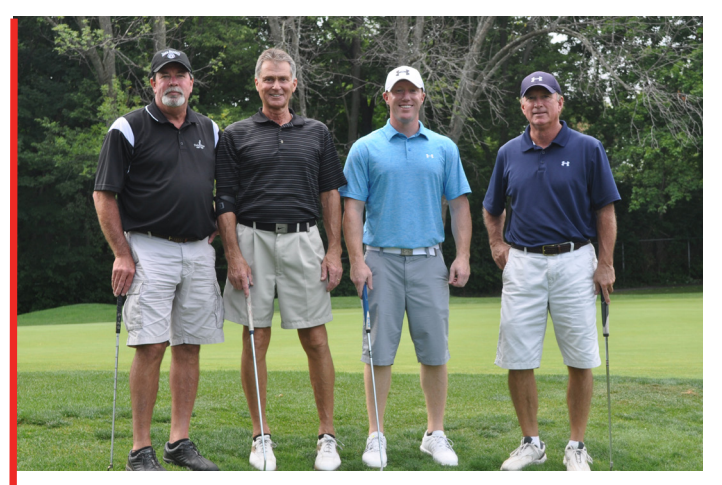
1ST PLACE TEAM, VOLK PAINTING (2), POSES FOR A PICTURE DURING THE GOLF SCRAMBLE

Greater Dayton Construction Group and the Oberer Thompson Company held its 11th annual golf outing at Walnut Grove Country Club on Monday, August 11. The four-man scramble format featured 34 teams with approximately 135 golfers participating in an afternoon session. Teams battled to compete for 1st/2nd/3rd and a "friendly skins" game.