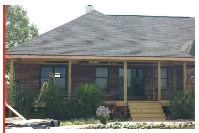
IN PROGRESS PHOTO OF COVERED PATIO AND DECKING AT HUBBARD RESIDENCE

To date, the covered patio and deck are in place and the project is scheduled for completion in September.