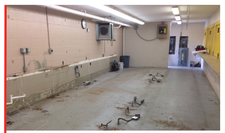
PHOTO OF HOME-SIDE CONCESSION STAND AFTER DEMOLITION EFFORTS AT CENTERVILLE HIGH SCHOOL FOOTBALL STADIUM

To prepare for the upcoming sports season, Centerville High School contracted Oberer Thompson Company in early July to provide renovations to their home-side concession stand at Centerville Stadium.