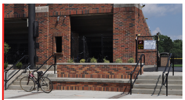
AFTER PHOTO WITH NEW PLANTER BOX AND STAIR SETS

The school's exterior improvement scope included: the installation of two new stair sets with handrails (one with bike ramp) and planter bed with seat wall.