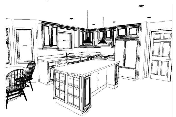
Rendering of Proposed Arnold Kitchen

The scope of the project will include the relocation of a powder room to accommodate the large island as well as the demolition of existing walls for room expansion.