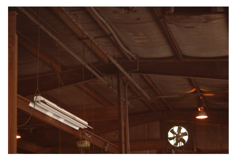
Smoke and Fire Damage to Insulated Ceilings

GDCG has been awarded the project which includes: replacing damaged insulated ceilings, all ventilation, exhaust and duct work, replacement of three chemical tanks and liners as well as soda blasting to all steel framework in the 7,000 square foot structure.