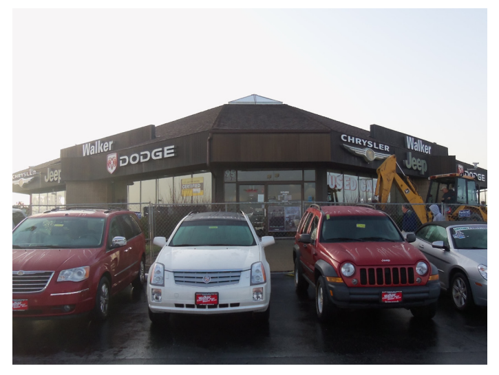
Before Photo of Exterior Elevation to Walker Chrysler Dodge Jeep Ram

In response to its corporate facility's image program changes, Walker Chrysler Dodge Jeep Ram, located on Loop Road in Centerville, is in the final stages of building renovations.