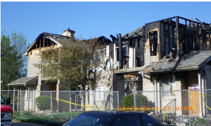
Fire Loss at Building #29 in Mill Pond Apartment Community

Building 29 (pictured above), houses eight individual units (only seven of which were occupied at the time of the fire).