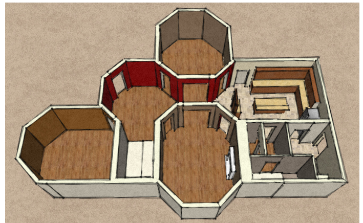
Proposed Rendering of 1st Floor Layout after Renovations

The project scope is scheduled to include a new kitchen plan, complete redesign of first and second floor layouts, removal of several interior load bearing walls, installation of a zoned forced air system (after the removal of existing boiler system) and complete renovation to all existing bathrooms.