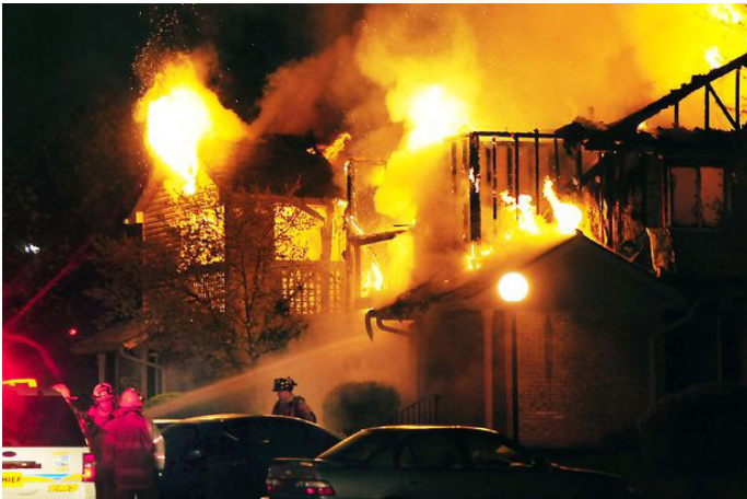
Fire at Mill Pond Apartment Community

Greater Dayton Construction Group's Emergency Response Team responded to a fire loss at the Mill Pond Apartment Community in Bellbrook, Ohio on April 25, 2013.