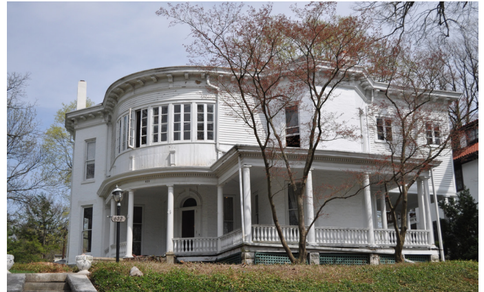
622 Oakwood Ave. Existing Front Elevation

Built in 1865, the house was one of the first homes built in the city and originally served as a spec house for the neighborhood.