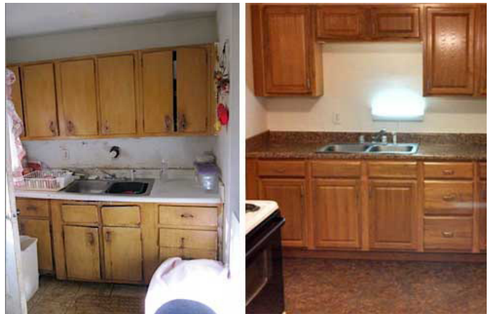
Before (Left) and After (Right) of Kitchen Repairs

Additional improvements to the property included light landscaping, interior finishes, and repair work to a hose bib that had frozen and created minor water damage.