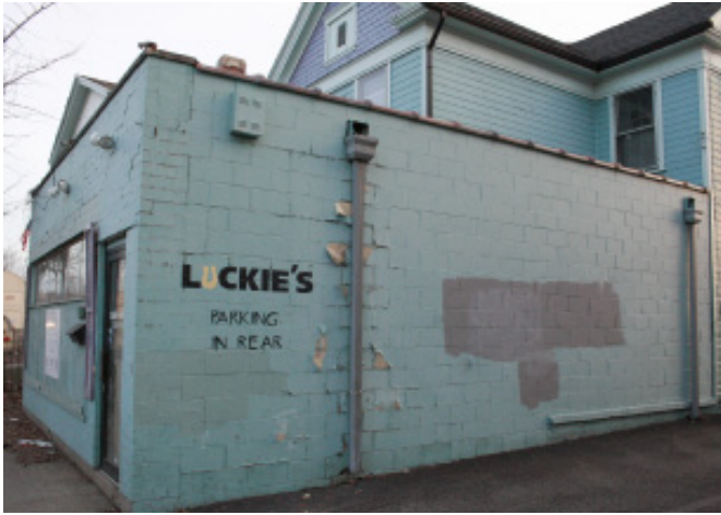
Exterior Commercial Space of Luckie's Before Renovations

The old Luckie's Check-into-Cash building (a building owned and managed by Full Circle Development LLC) located at 1207 Wayne Avenue in the Historic South Park District has received the second phase of its scheduled renovations.