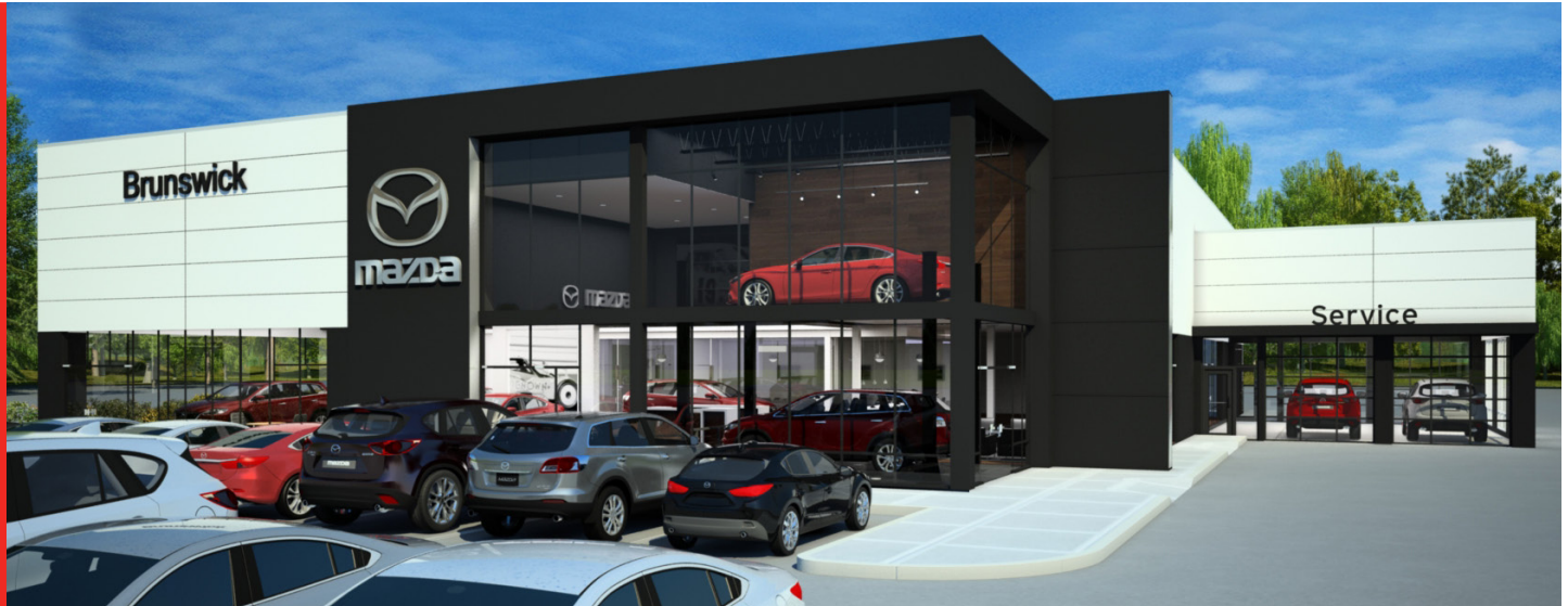
RENDERING OF PROPOSED MAZDA AUTO DEALERSHIP IN BRUNSWICK, OHIO

— RENDERING COURTESY OF INTERBRAND DESIGN FORUM