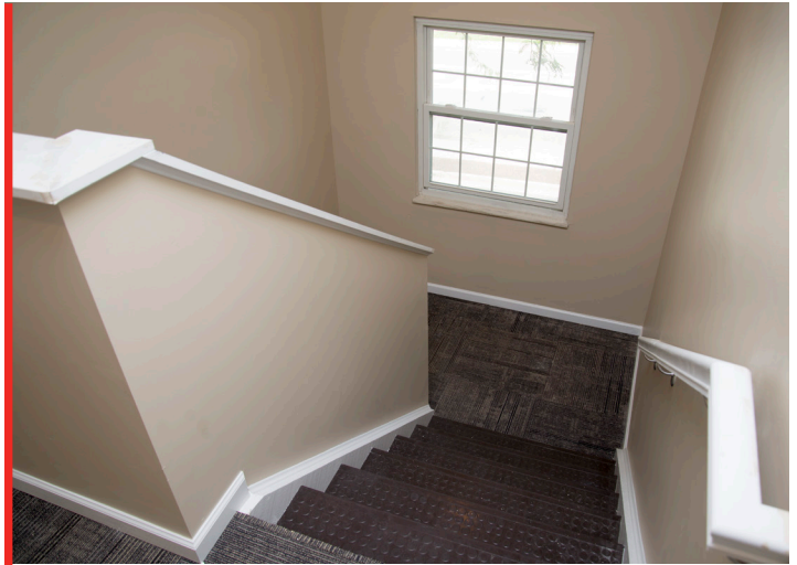
PROGRESS PHOTO OF STAIRCASE AREA AT GARDEN APARTMENTS

Each of the five buildings received updated common areas, stairwell repairs, and updates to the lighting and life-safety systems.