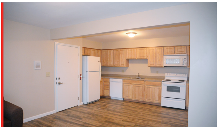
PHOTO OF GARDEN APARTMENTS AFTER PHASE I INTERIOR RENOVATIONS (SUMMER 2015)

Phase I renovations — completed by GDCG in August 2015 — included the modernization of the interiors of 60 units.