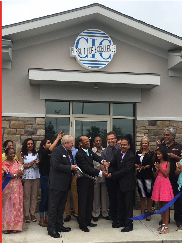
CIC REPRESENTATIVES (WITH FRIENDS AND FAMILY) POSE WITH BEAVERCREEK CITY OFFICIALS FOR A QUICK PHOTO DURING THE RIBBON CUTTING CEREMONY

On Thursday, July 7, the Clinical Inquest Center (CIC) hosted a ribbon cutting ceremony to celebrate the grand opening of its new Beavercreek healthcare facility.