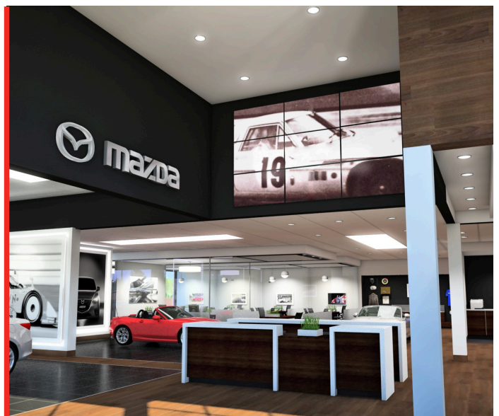
RENDERING OF PROPOSED SHOWROOM AT BRUNSWICK MAZDA

— RENDERING COURTESY OF INTERBRAND DESIGN FORUM