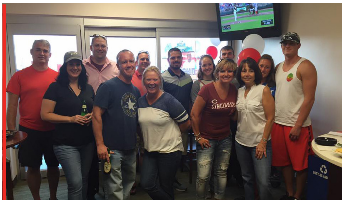
GAME ATTENDEES POSE FOR A QUICK PHOTO AT THE GDCG SUITE

In addition to the beverage tasting, Greater Dayton Construction Group hosted a second evening out at 5/3rd Field on Thursday, July 28th.